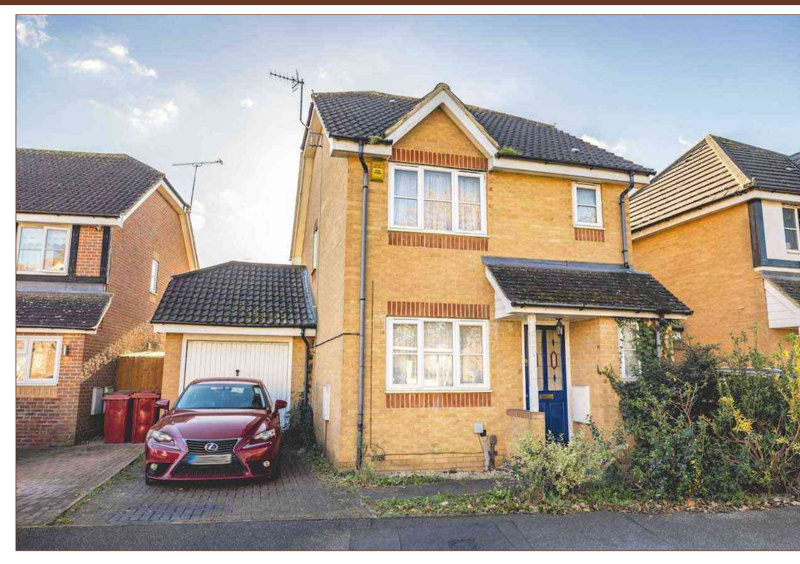
This three bedroom link-detached house is situated within a popular modern development within walking distance of the local shops including Asda Supermarket, Burnham Station on the Elizabeth Line and the popular Westgate Academy School whilst Junctions 6 and 7 of the M4 motorway is within a short drive.

The property is offered to the market as well presented and the ground floor features two reception rooms with the inclusion of a 16ft living room and an 11ft dining room with French doors onto the rear garden. There is also an 11ft fitted kitchen and a downstairs cloakroom.