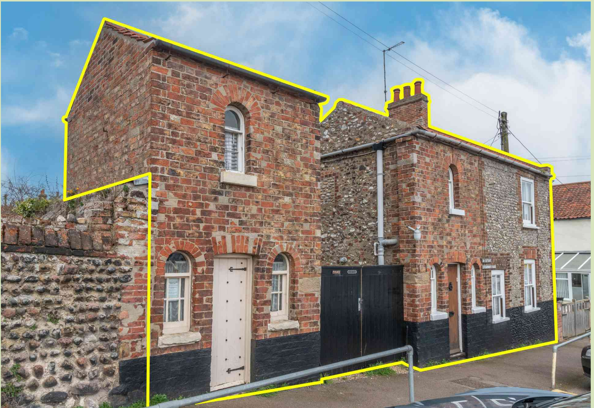
The Cottage, Wells-next-the-Sea Offers in Excess of £400,000