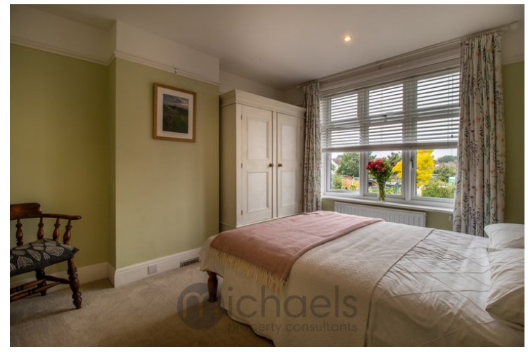
11' 11" x 10' 7" (3.63m x 3.23m) With UPVC double glazed window to rear aspect overlooking garden, radiator.