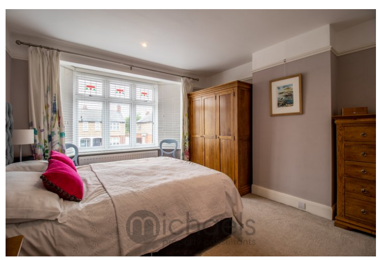
11' 10" \times 11' 7" (3.61m x 3.53m) With UPVC double glazed feature bay window to front aspect, radiator.