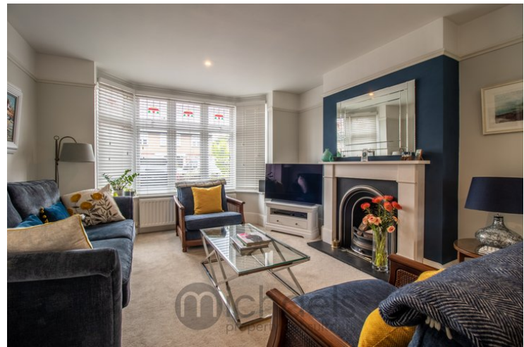
12' 6" x 11' 9" (3.81m x 3.58m) With UPVC double glazed feature bay window to front aspect, TV point, radiator, feature open fireplace, open to;