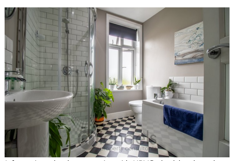
A four piece bathroom suite with UPVC double glazed obscure window to rear, heated towel rail, wash hand basin, panelled bath with tiled splashback, enclosed shower cubicle, close coupled WC.