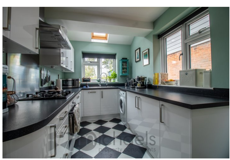
12' 9" x 7' 4" (3.89m x 2.24m) With UPVC double glazed window to rear and side aspect, Velux window, door to side, a range of matching eye level and base units with drawers and worktops over, inset sink and drainer, integrated slimline dishwasher, fridge and freezer, electric oven, gas hob with extractor hood over, spotlights.