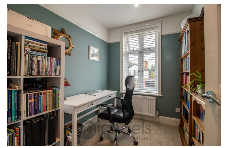
8' 7" x 6' 5" (2.62m x 1.96m) With UPVC double glazed window to front aspect, radiator.