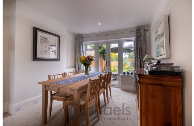
11' 10" x 10' 6" (3.61m x 3.20m) With UPVC double glazed windows and French doors to rear aspect, radiator, spotlights.