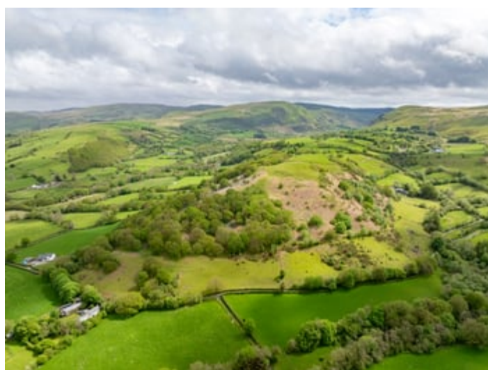
LAND (SECOND IMAGE)