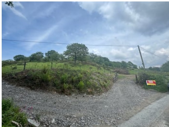
LAND (FIRST IMAGE)