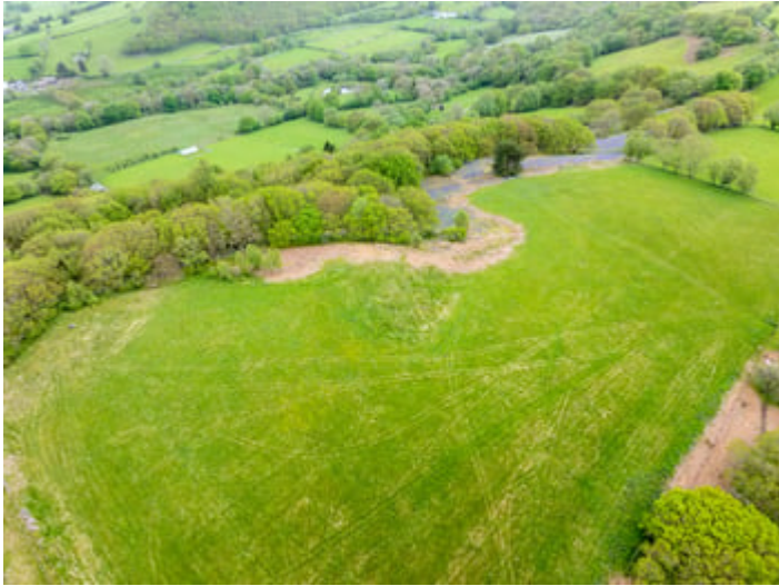
LAND (THIRD IMAGE)