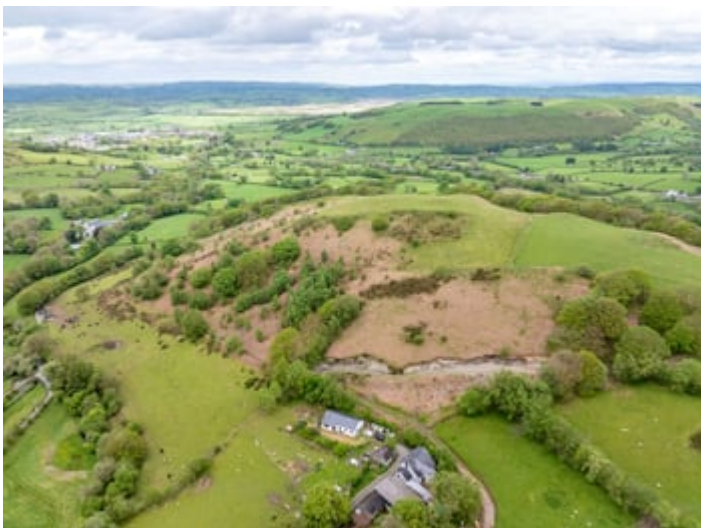
LAND (FIFTH IMAGE)