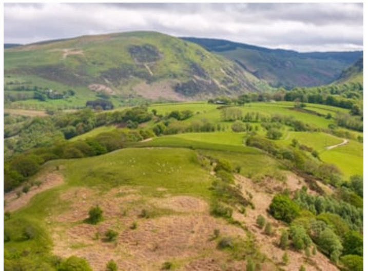
OVERLOOKING CAMBRIAN MOUNTAINS