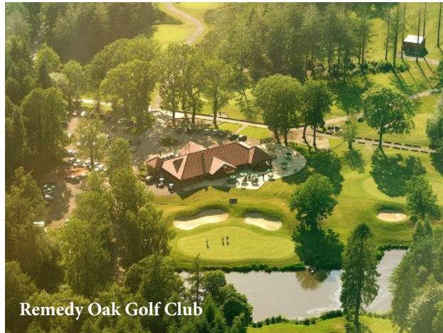
Remedy Oak Golf Club