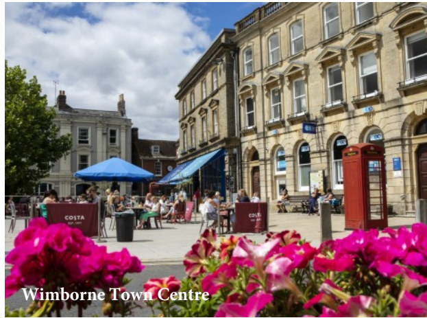
Wimborne Town Centre