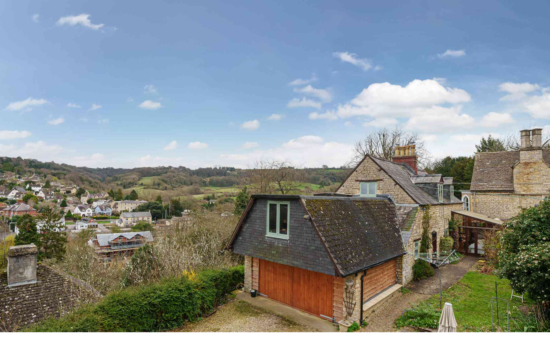
Pad Cottage, Butterrow Hill, Stroud, Gloucestershire, GL5 2LF Guide Price £585,000