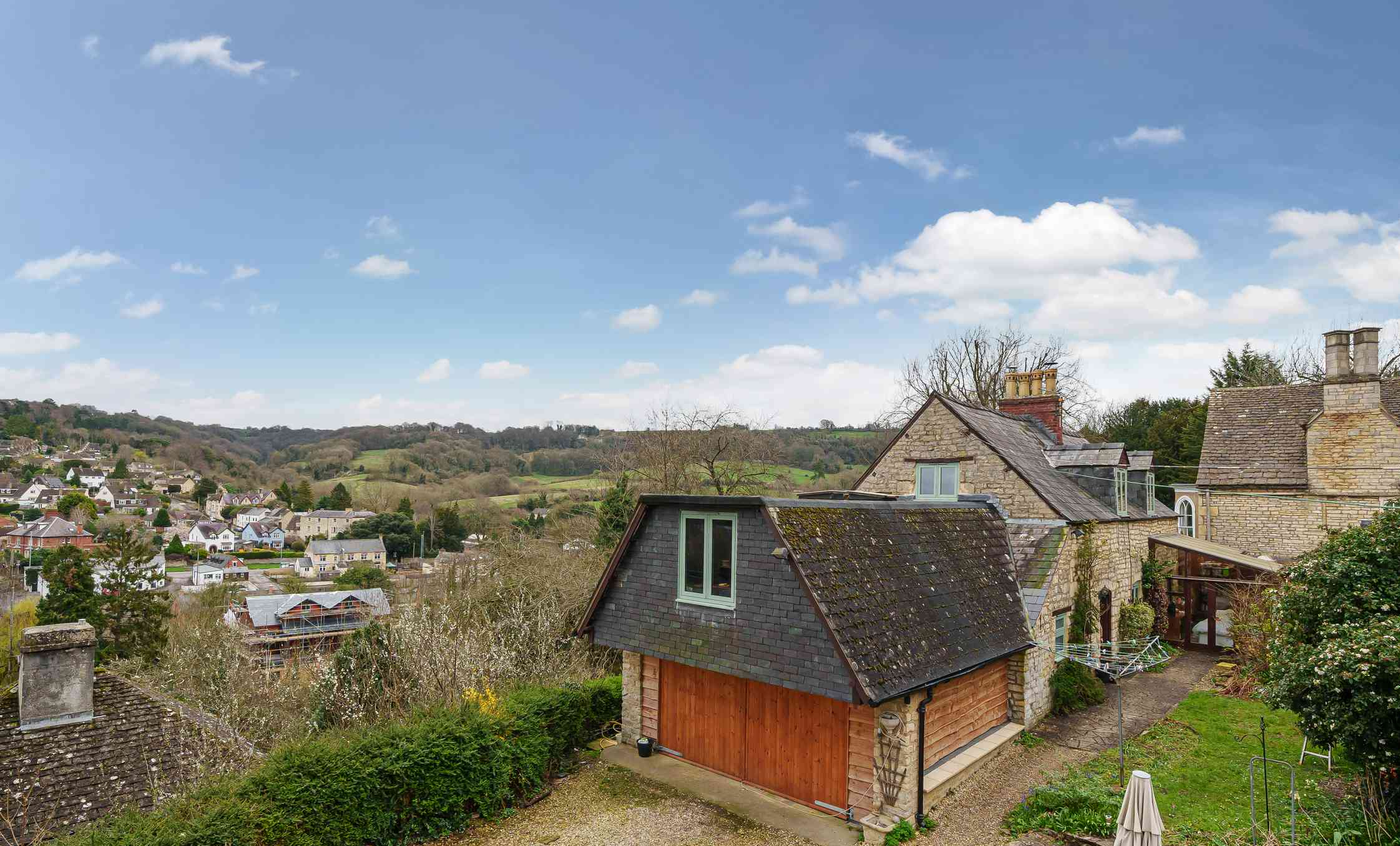
Pad Cottage, Butterrow Hill, Stroud, Gloucestershire, GL5 2LF Guide Price £585,000