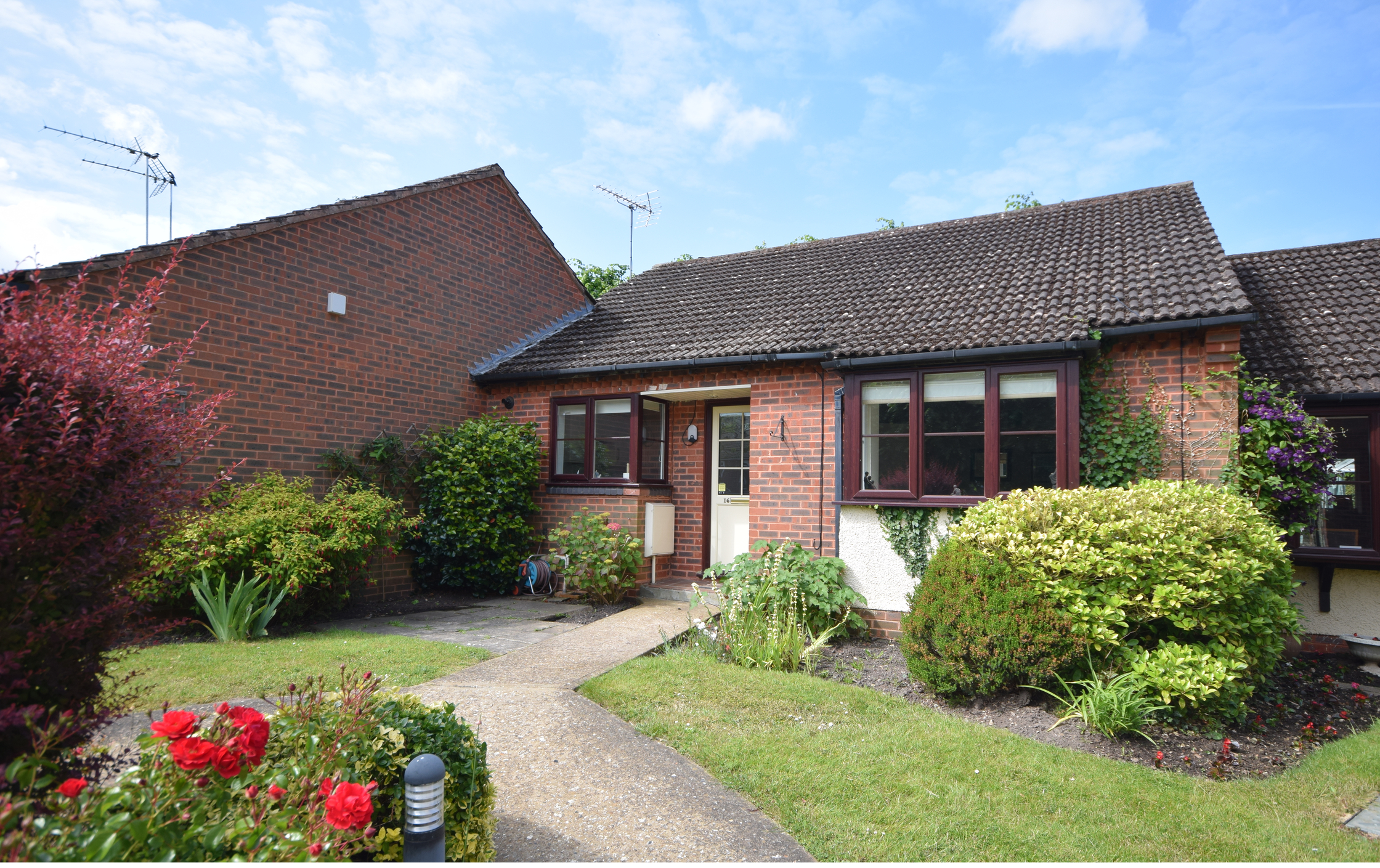
16 Stratford Court Avon Road, Farnham, Surrey. GU9 8PG. Guide Price £350,000