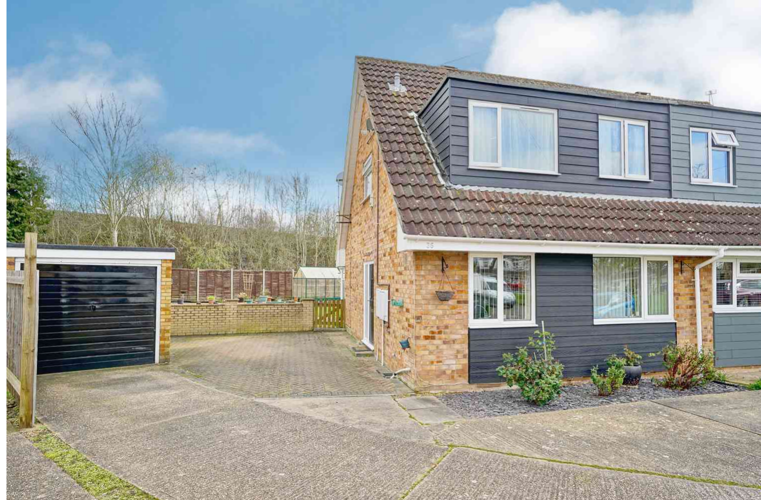
Manor Lane, Alconbury PE28 4EH