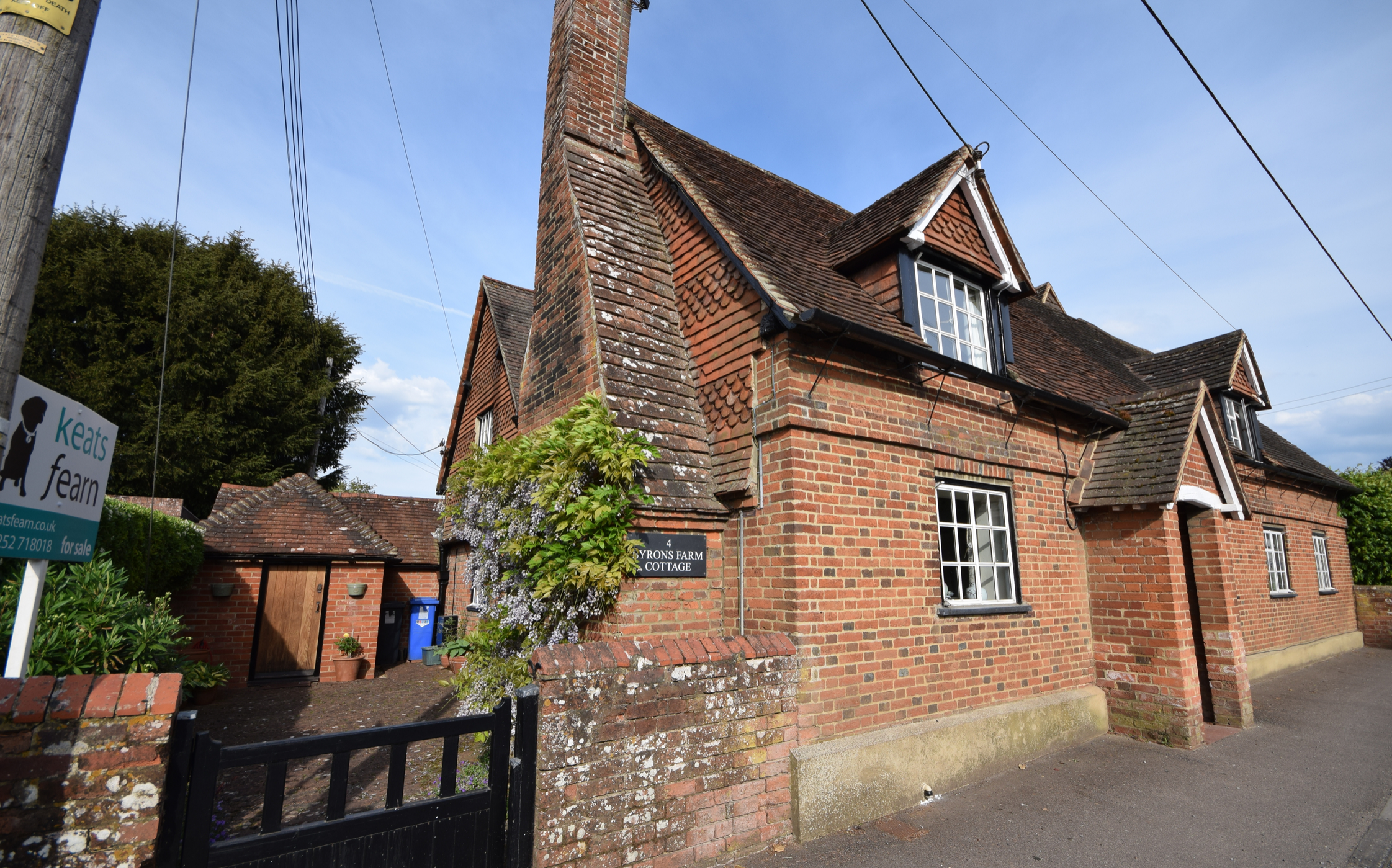
4 Byrons Cottages, Dippenhall Street, Crondall, Farnham, Hampshire. GU10 5PE. Offers Over £625,000