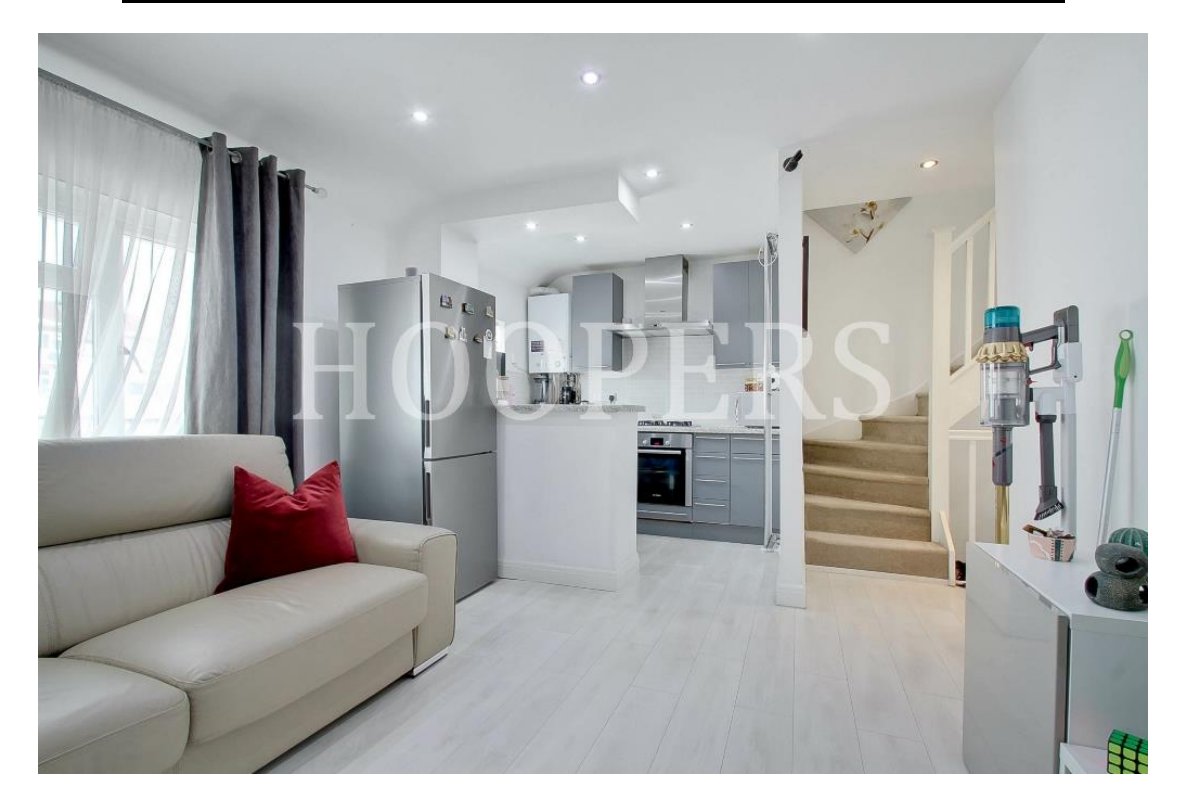
EPC Rating: C

Presenting this larger than average first/second floor split level converted flat which provides exceptional living space. The property is situated close to the junction with Brook Road. Benefits include: