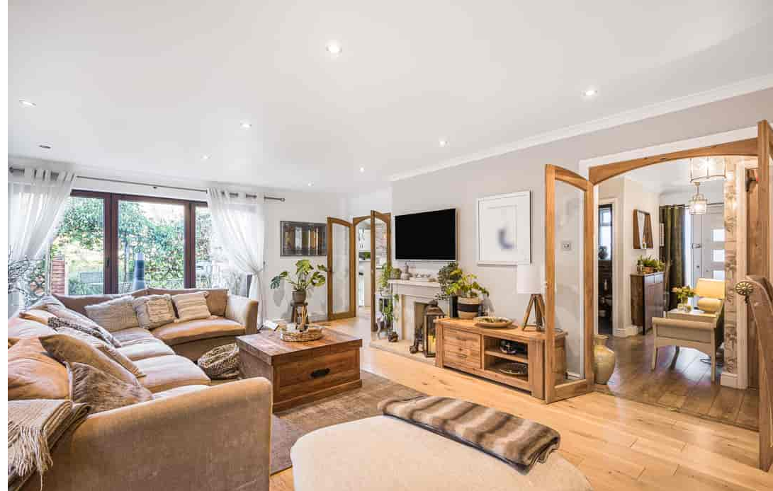
216 Marlow Bottom, Marlow, Buckinghamshire SL7 3PR £895,000 - Freehold