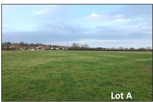
Auction Guide Price: OFFERED FOR SALE IN TWO LOTS*

Thursday 24<sup>th</sup> April 2025, 12 midday The Theatre, The Royal Bath and West Showground, Shepton Mallet, BA4 6QN Bid remotely via Livestream, in person or by proxy.