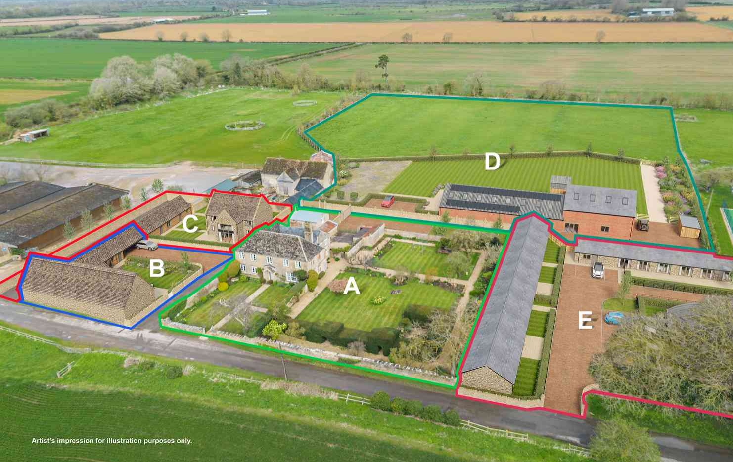
Artist's impression for illustration purposes only.