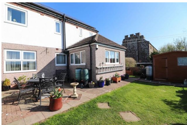
REAR OF THE PROPERTY