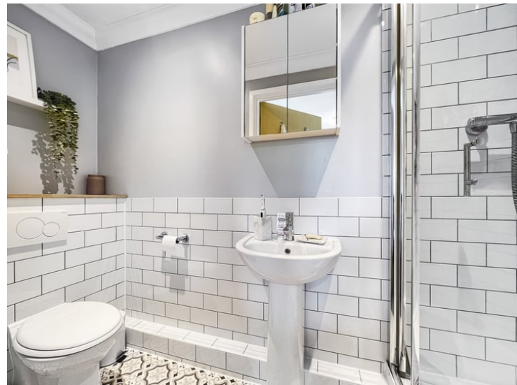
En Suite To Master