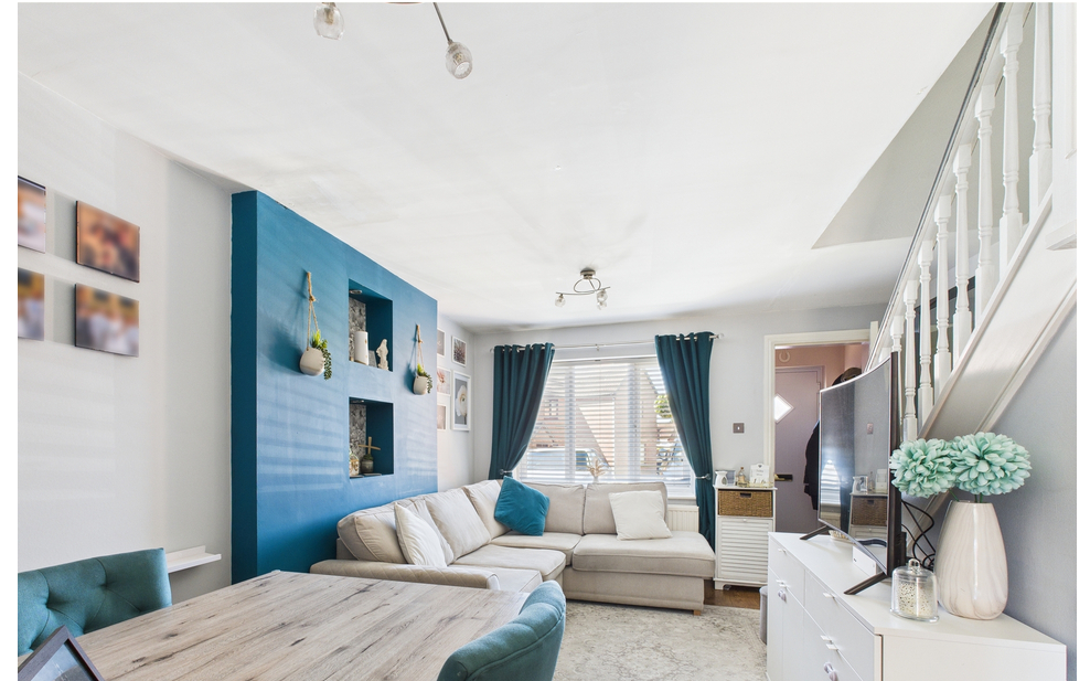
Blackthorne Close, Kilburn, Belper, Derbyshire DE56 0LF £185,000 - Freehold