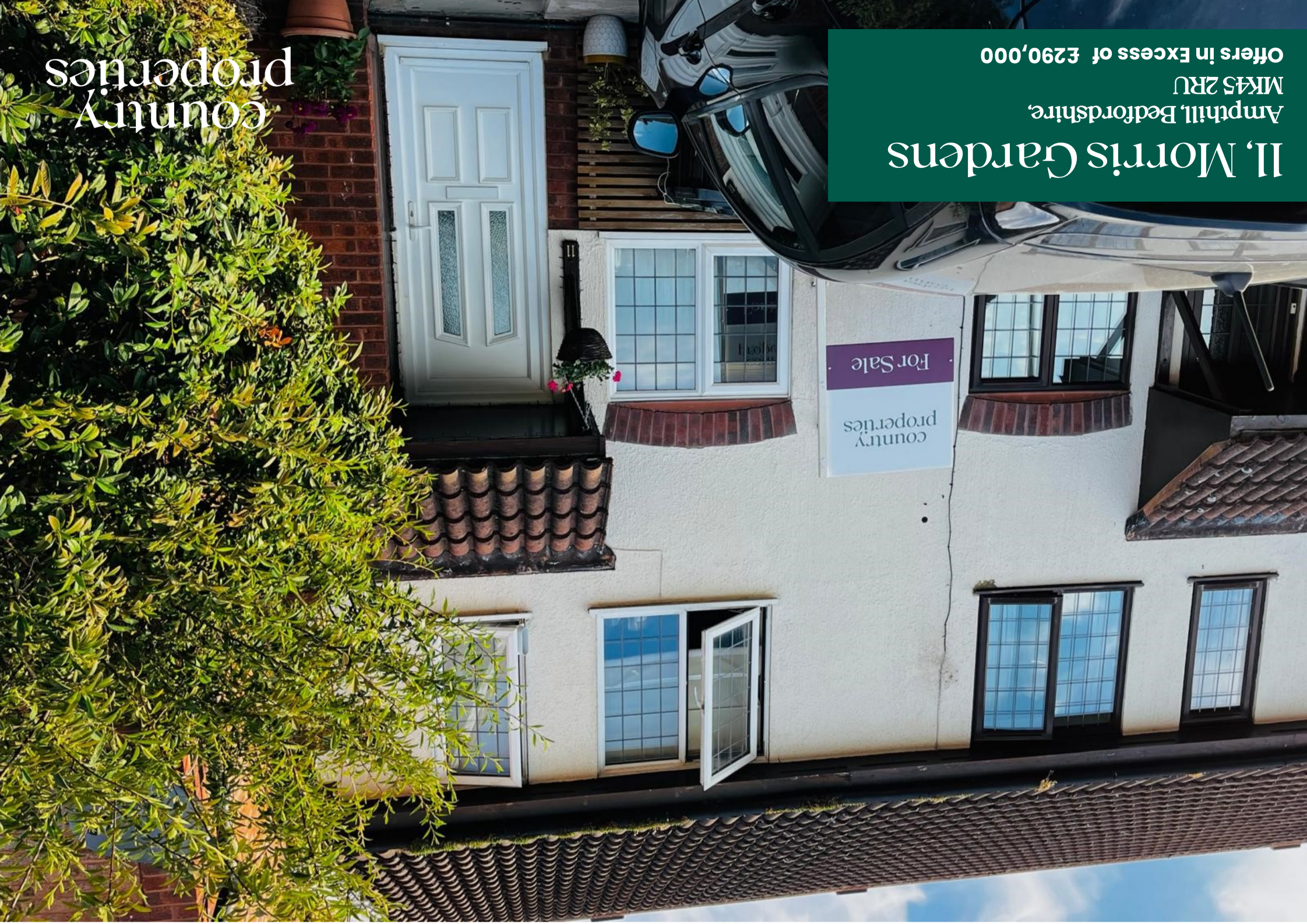
GROUND FLOOR 297 sq.ft. (27.6 sq.m.) approx.