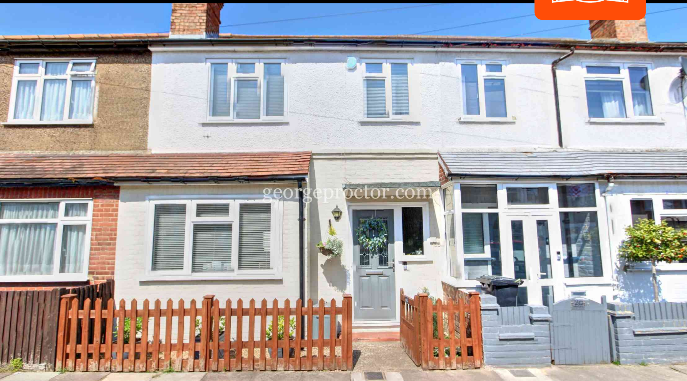
Herbert Road, Bromley, Kent. BR2 9SH