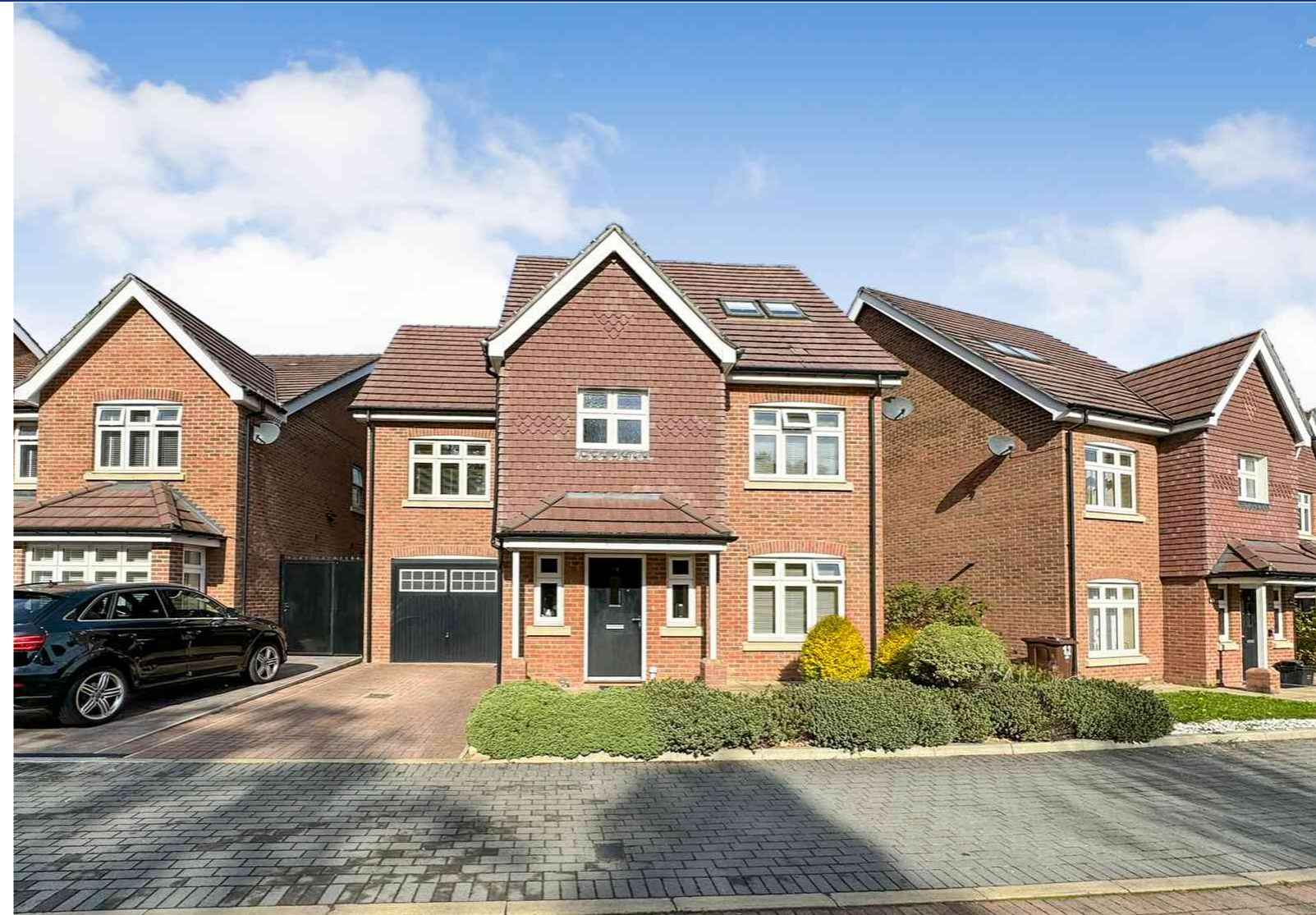
Faringdon Road, Earley, Reading, Berkshire. RG6 1FP.