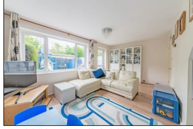
15' 3" x 12' 6" (4.65m x 3.81m) Double glazed window to rear, double glazed door to garden, laminate wood floor.