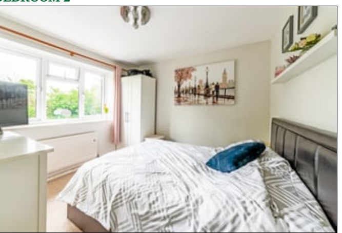
9' 6" x 8' 8" (2.90m x 2.64m) Double glazed window to rear, radiator.