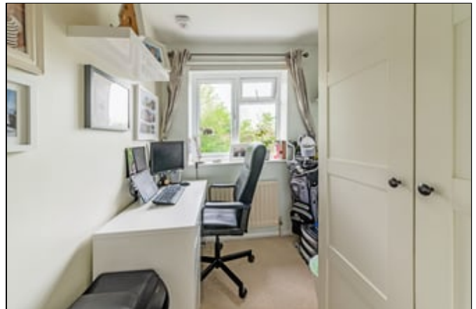
6' 4" x 5' 8" (1.93m x 1.73m) Double glazed window to rear, radiator.