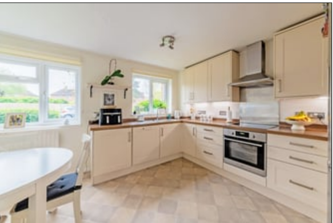
15' 3" x 10' 9" (4.65m x 3.28m) Fitted with shaker style wall and base units, wood effect worktops and upstands, stainless steel 1 1/2 bowl single drainer sink unit, integrated Bosch hob with stainless steel splashback and extractor hood, integrated oven, dishwasher and washing machine, wall mounted boiler in cupboard, double glazed window to front.