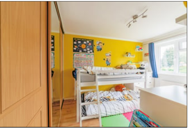
13^{\circ} 8" x 7' 1" (4.17m x 2.16m) Double glazed window to front, radiator, fitted sliding door wardrobes.