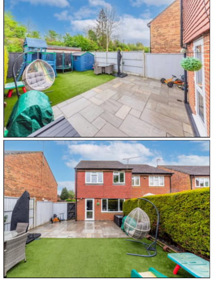
Approximately 30ft long with paved patio, simulated grass, double storey adventure playhouse with swing, storage shed, side pedestrian access.