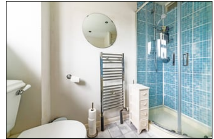
7' 6" x 7' 6" (2.29m x 2.29m) White suite comprising panelled bath with mixer and shower attachment, vanity unit, low level W.C., corner enclosed shower cubicle, chrome heated towel rail, localised tiling, airing cupboard housing hot water tank, double glazed window to front.