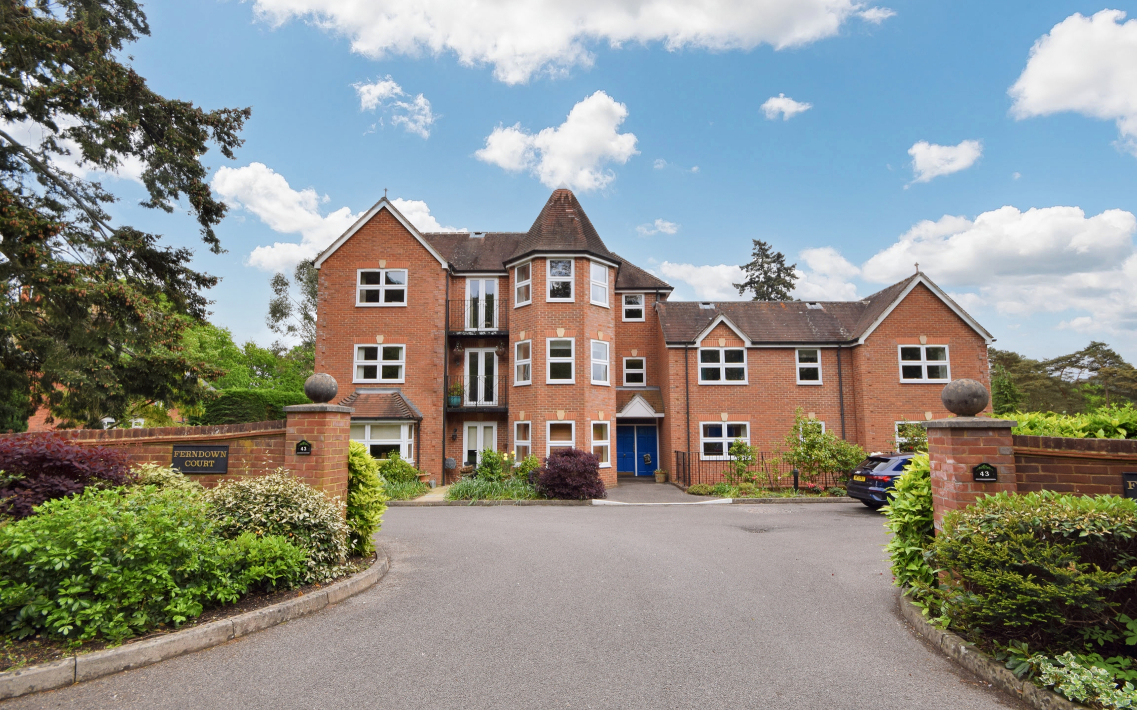
9 Ferndown Court, Frensham Road, Lower Bourne, Farnham, Surrey. GU10 3PZ. Guide Price £350,000