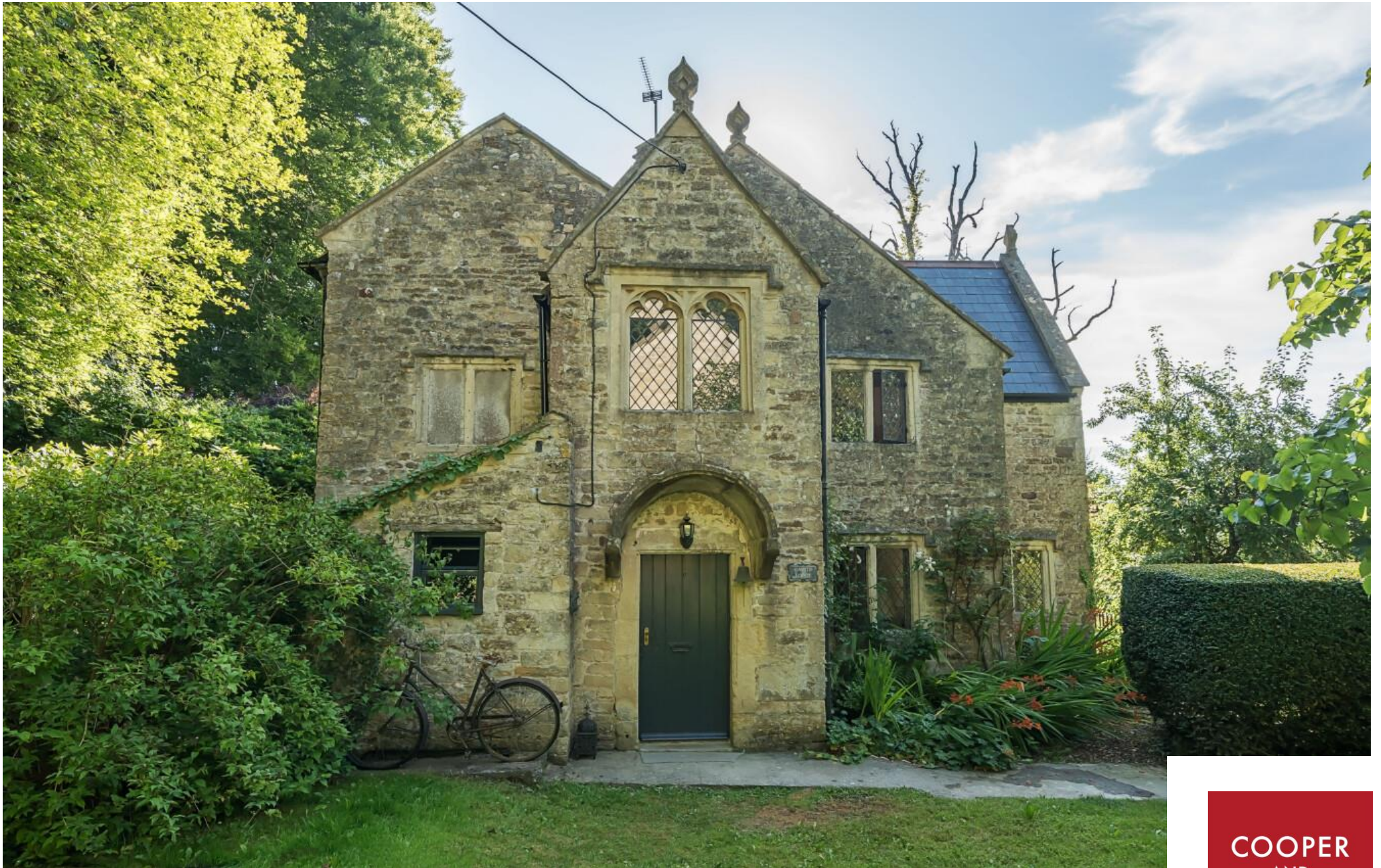
Castle Lodge, Murtry, Orchardleigh, Frome BA11 2PB