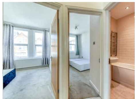
Ellison Road, London, SW16