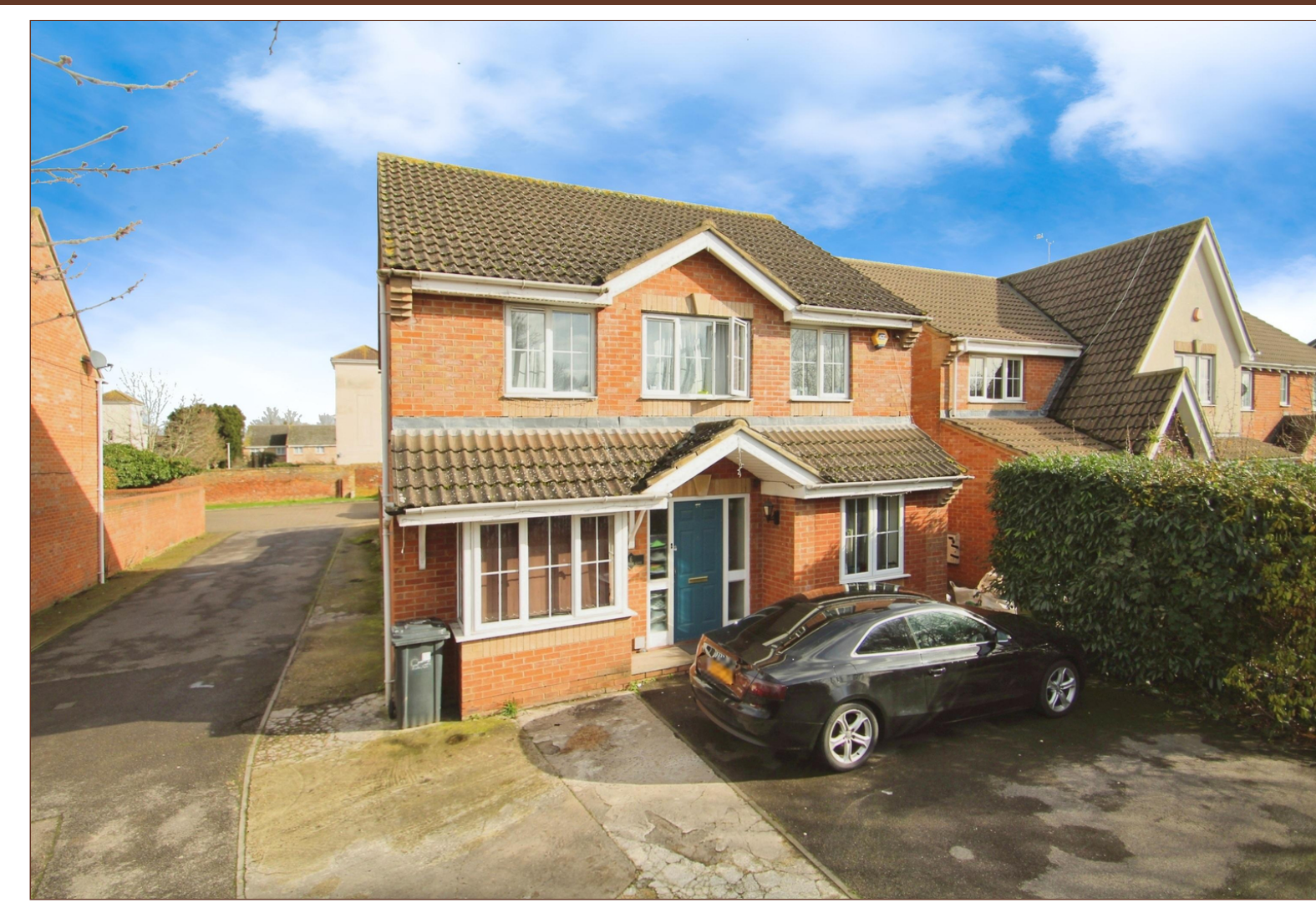
Nestled within the enclave of Glasshouse Close, this exceptional five-bedroom detached house offers an idyllic blend of spacious living, modern comfort, and stylish design. A testament to sophisticated living, the property boasts an expansive reception room that spans the length of the house, providing an inviting space for both relaxation and entertaining.

The well-appointed kitchen, situated separately, offers a practical and stylish culinary haven. The ground floor also hosts a generously sized double bedroom, ensuring convenience and accessibility for residents.