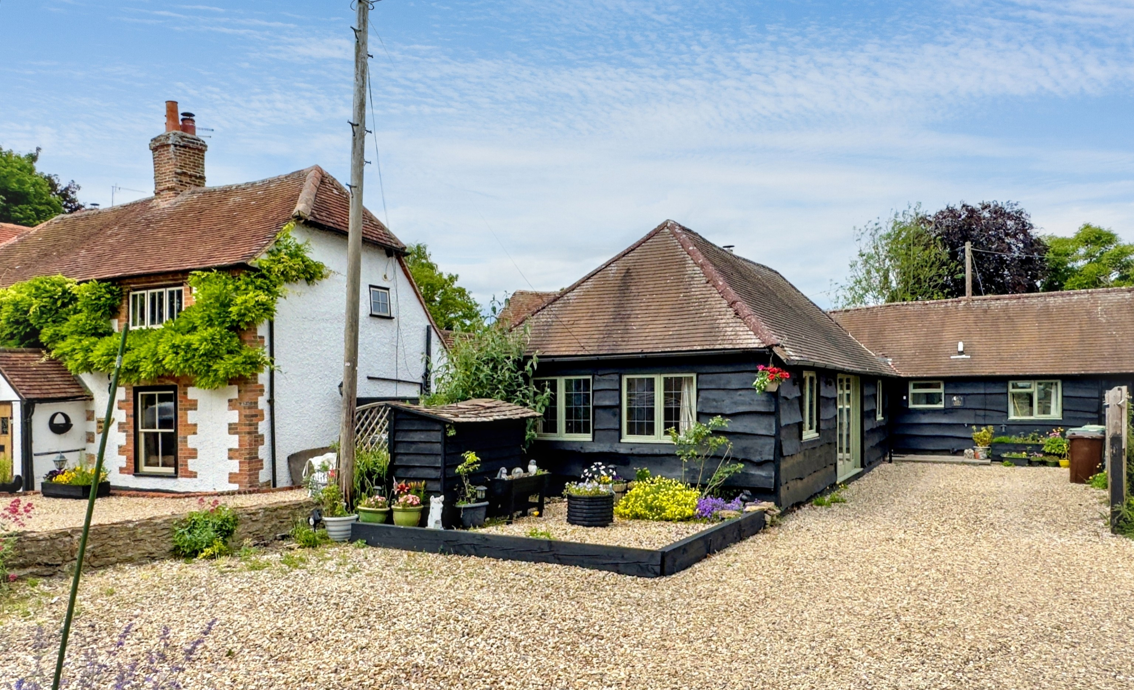
The Croft Barn, Church Street, East Hendred, Wantage OX12 8LA Oxfordshire, £495,000