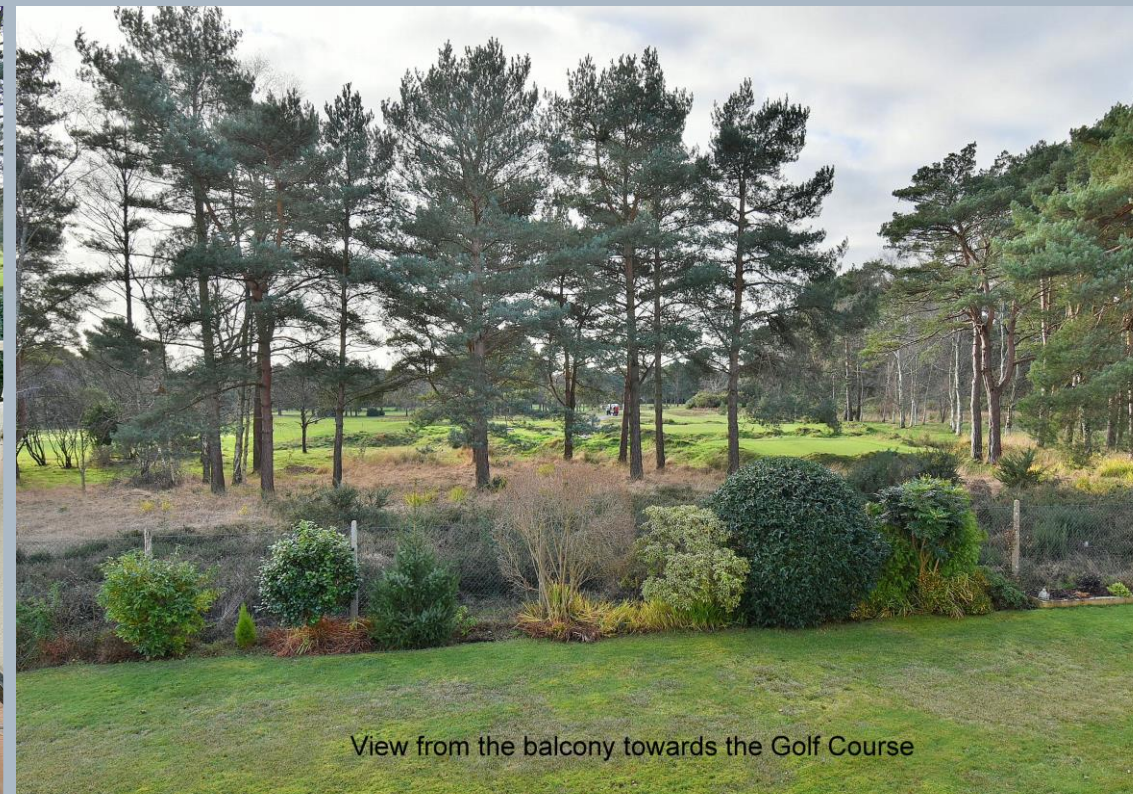
View from the balcony towards the Golf Course