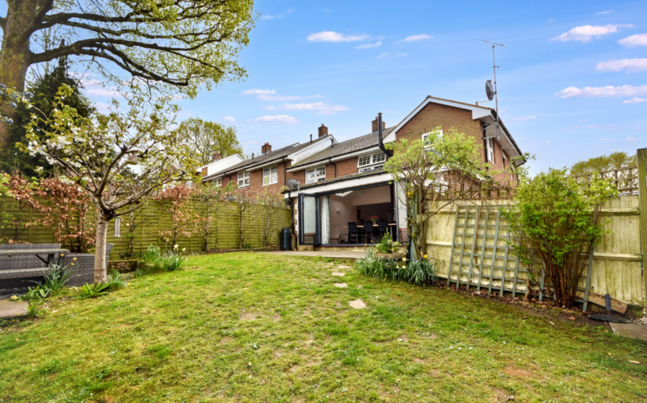
4 Thistledown Close, Wrecclesham, Farnham, Surrey. GU10 4AG. Guide Price £585,000