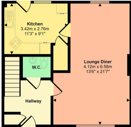
Ground Floor Approx 45 sq m / 479 sq ft

Approx Gross Internal Area 89 sq m / 960 sq ft