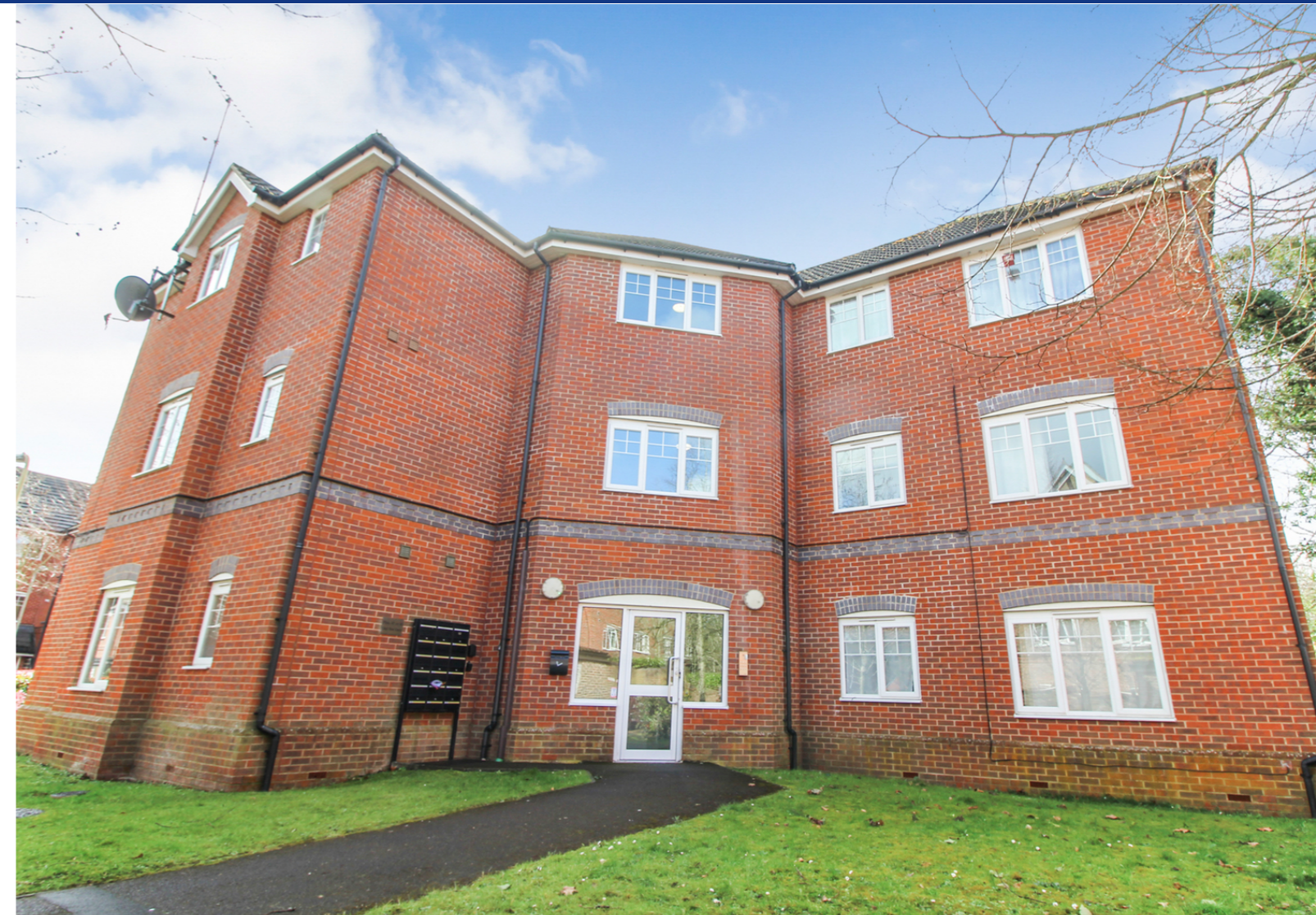
Ashdene Gardens, Reading, Berkshire.

TOTAL FLOOR AREA : 483 sq.ft. (44.9 sq.m.) approx. Whilst every attempt has been made to ensure the accuracy of the floorplan contained here, measurements of doors, windows, rooms and any other items are approximate and no responsibility is taken for any error, omission or mis-statement. This plan is for illustrative purposes only and should be used as such by any prospective purchaser. The services, systems and appliances shown have not been tested and no guarantee as to their operability or efficiency can be given. Made with Metropix ©2023