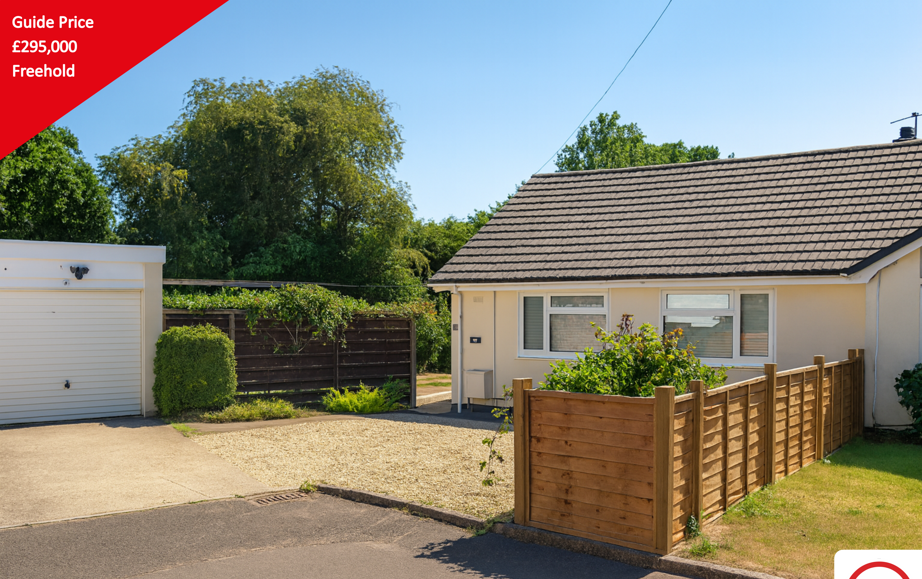
Meadow Close, Nether Stowey, Bridgwater, Somerset TA5 1LY 2 Bedroom Semi-Detached Bungalow