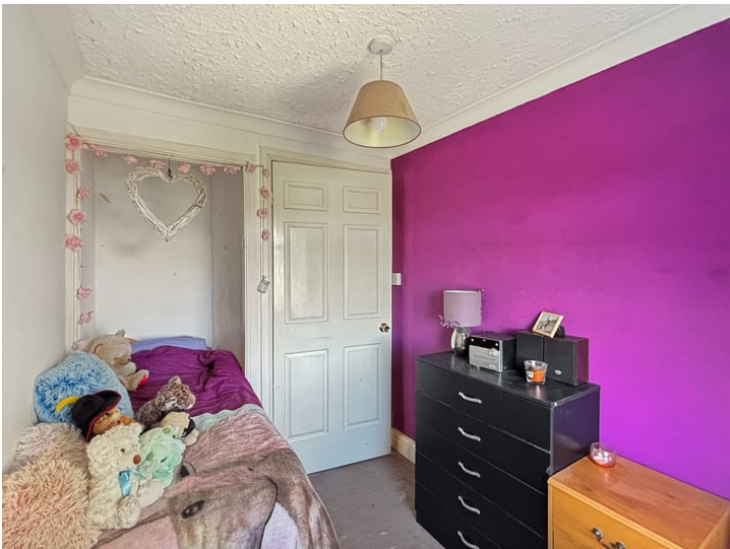
8' 4" x 8' 6" (2.54m x 2.59m) Window to rear, radiator.