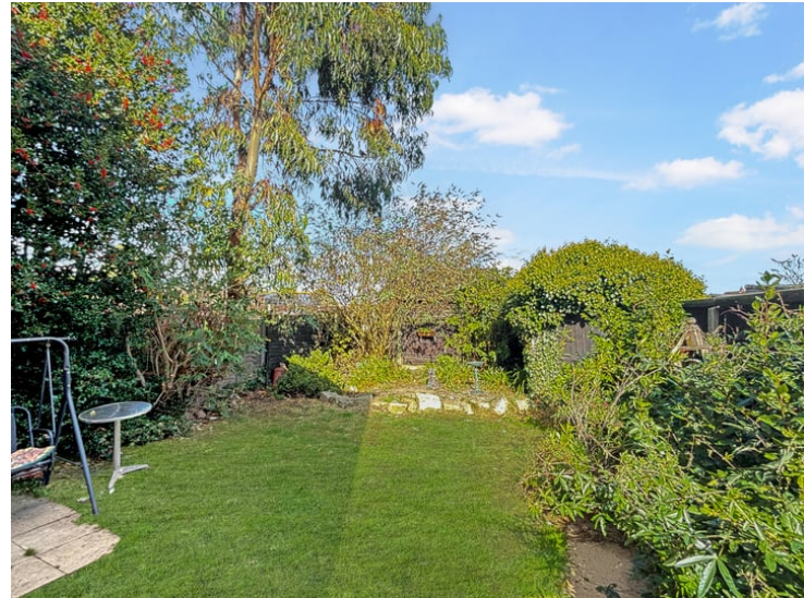
Laid to lawn and patio, garden shed, retained by fencing, gated side access.