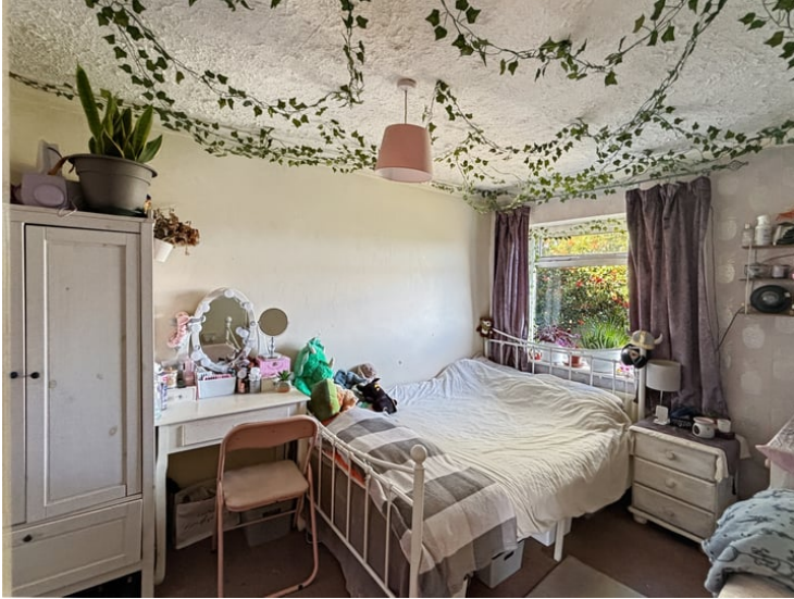
11' 10" x 8' 6" (3.61 m x 2.59m) Window to rear, radiator.