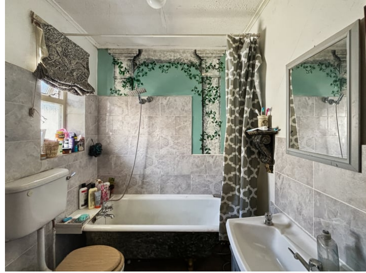
Window to side, radiator, low level W.C, bath with over head shower and mixer taps, towel rail, storage cupboard, part tiled walls.