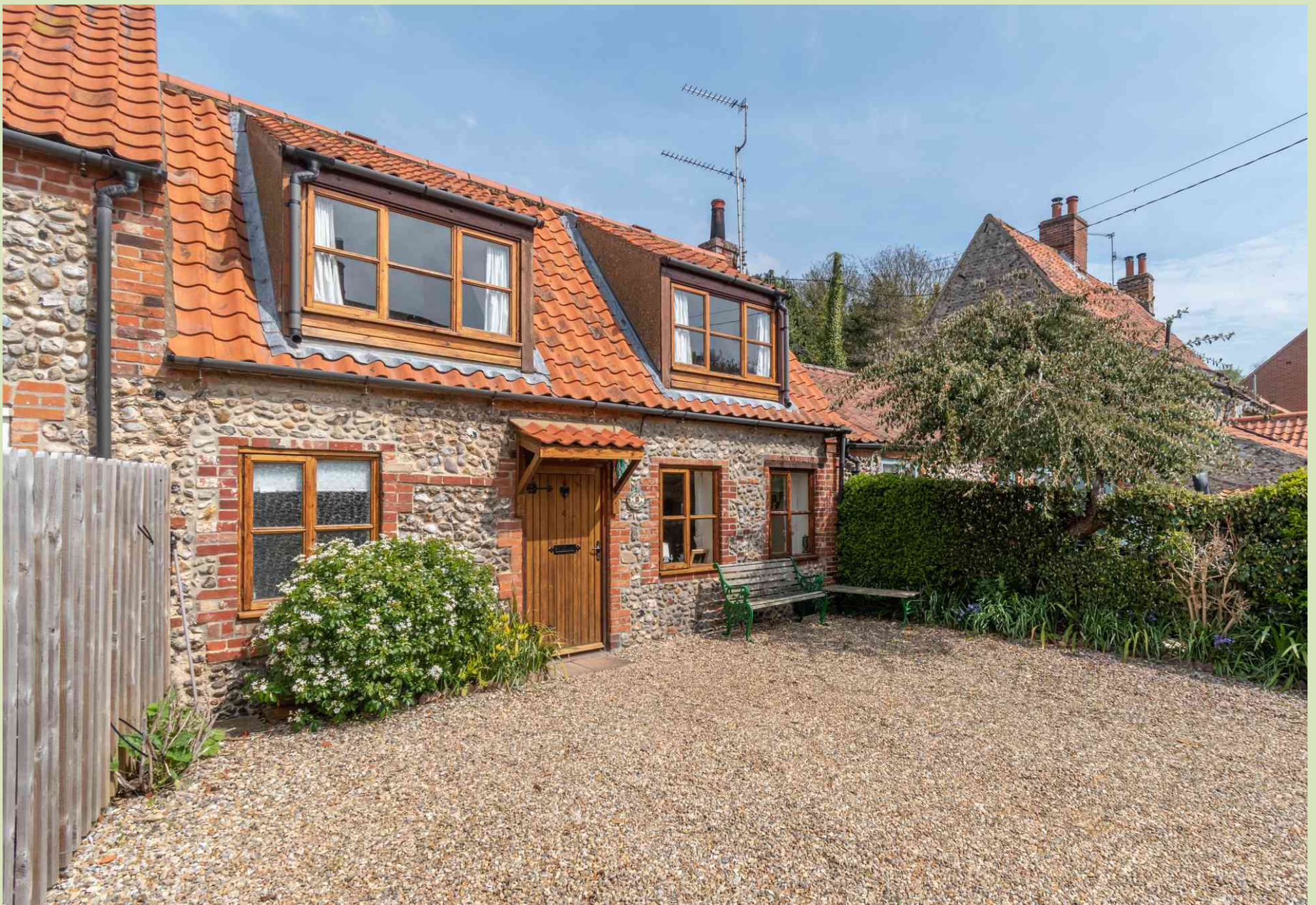
Post Box Cottage, Stiffkey Guide Price £425,000