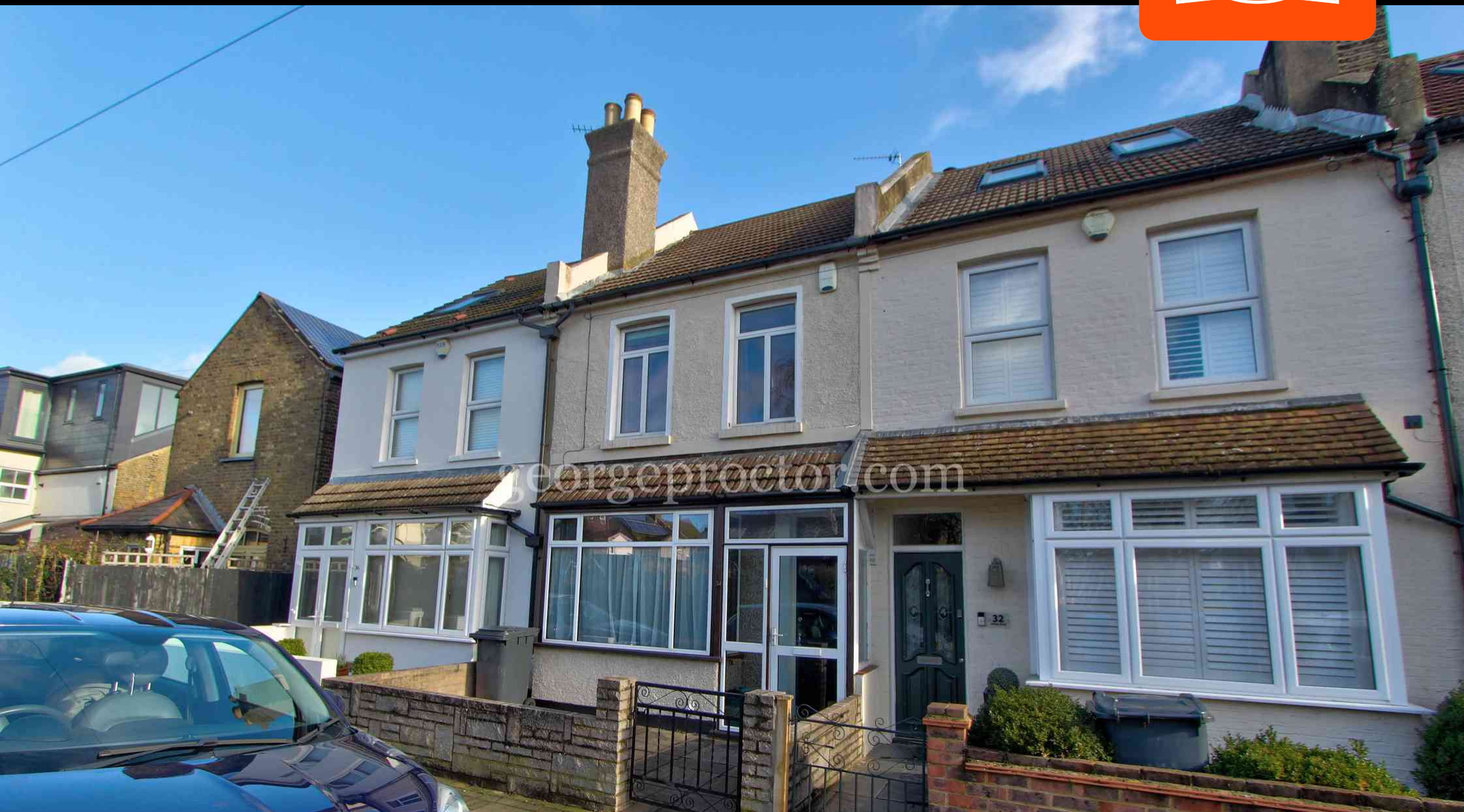
34 Jaffray Road, Bromley, Kent. BR2 9NR