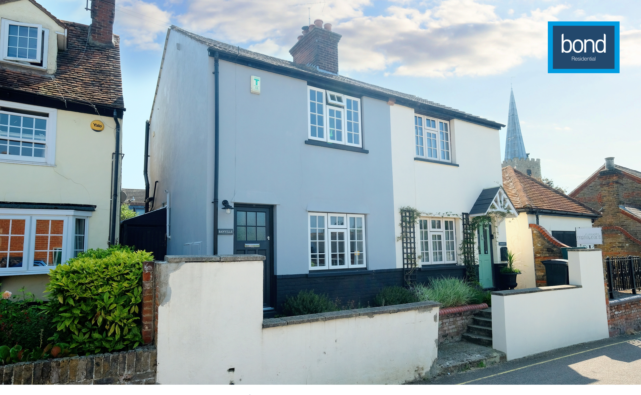
Bell Street, Great Baddow, Chelmsford, Essex, CM2 7JS