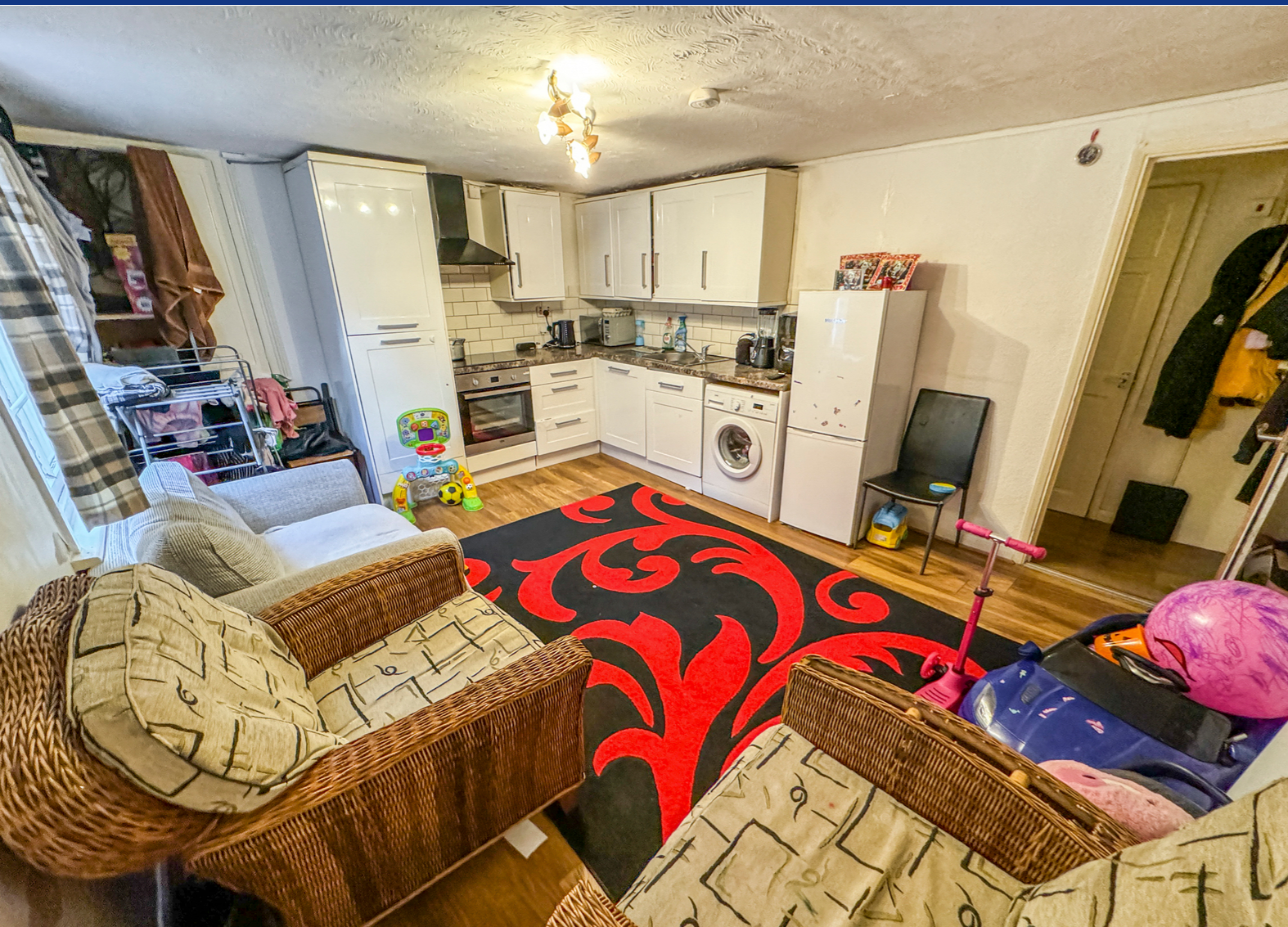
GROUND FLOOR 391 sq.ft. (36.3 sq.m.) approx.