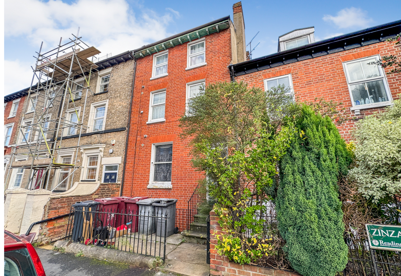
Basement Flat, Zinzan Street, Reading.