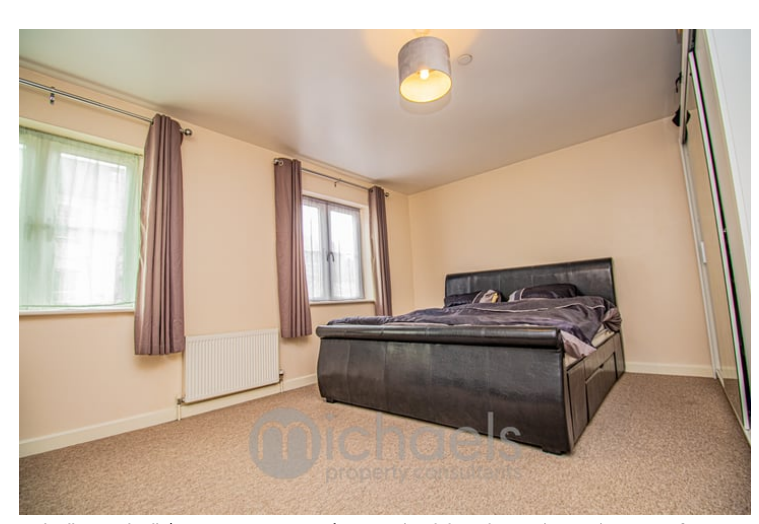
15^{\circ}\,5^{\circ}\,x\,12^{\circ}\,5^{\circ} (4.70m x 3.78m) Two double glazed windows to front, panelled heater.