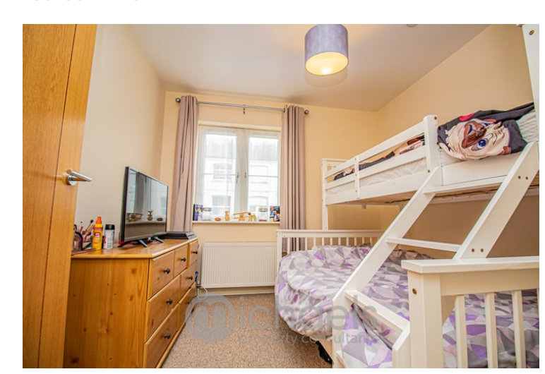
9'4" \times 9'3" (2.84m x 2.82m) Double glazed window to front, panelled heater.