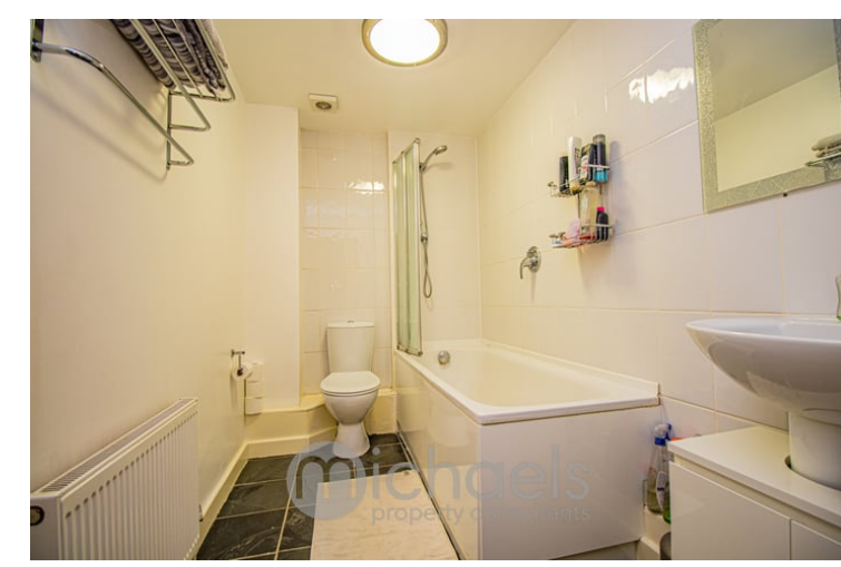
Heated chrome towel rail, WC, pedestal hand wash basin, panelled bath with shower over, extractor fan, tiled walls & floor.