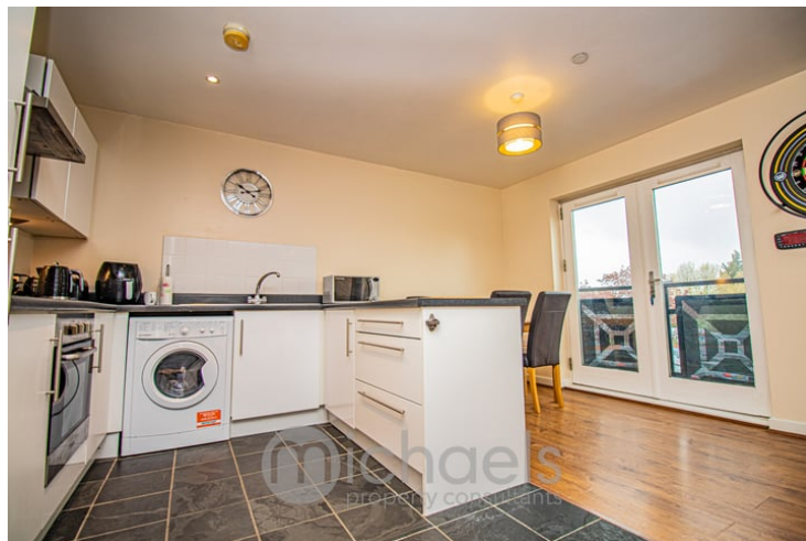
21' 6" x 15' 2" (6.55m x 4.62m) Double glazed window & Juliet balcony to the rear, radiator, wood effect laminate flooring, panelled heater.

Kitchen - Matching wall & base units with worktops over, inset sink with side drainer unit, splashback, integrated oven & hob with extractor over, integrated dishwasher & fridge/freezer, space for washing machine,