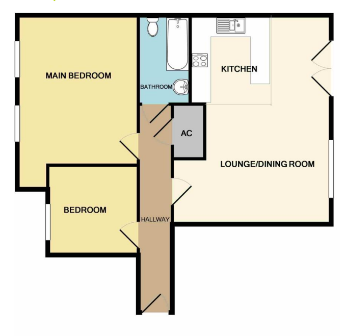
TOTAL APPROX. FLOOR AREA 750 SQ.FT. (69.7 SQ.M.)

Whilst every attempt has been made to ensure the accuracy of the floor plan contained here, measurements of doors, windows, rooms and any other items are approximate and no responsibility is taken for any error, omission, or mis-statement. This plan is for illustrative purposes only and should be used as such by any prospective purchaser. The services, systems and appliances shown have not been tested and no guarantee as to their operability or efficiency can be given Made with Metropix ©2019