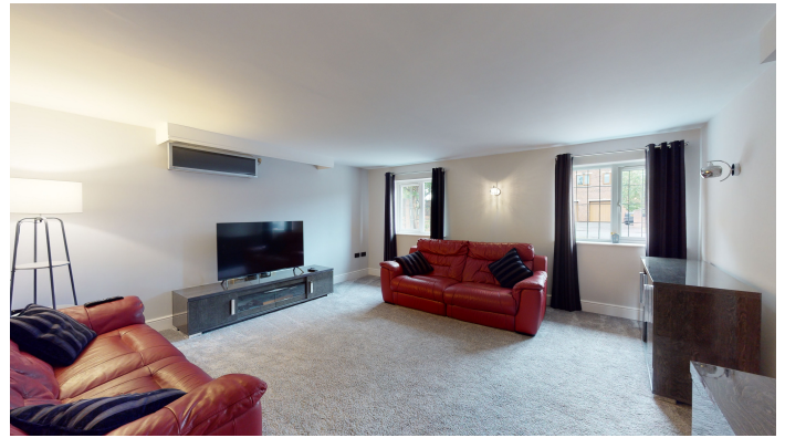
Multi Use Room