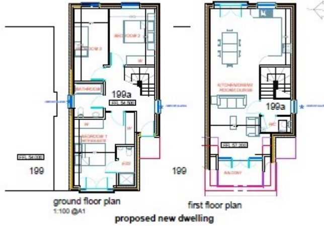
ground floor plan 1:100 @A1 first floor plan proposed new dwelling

1:1250@A4 OS ref SZ 0392 NW OS licence no 100017330