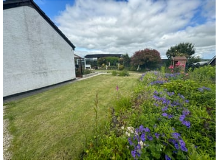
GARDEN (THIRD IMAGE)