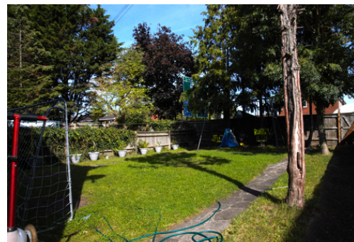
494a London Road, Slough, Berkshire. SL3 8QX. £280,000