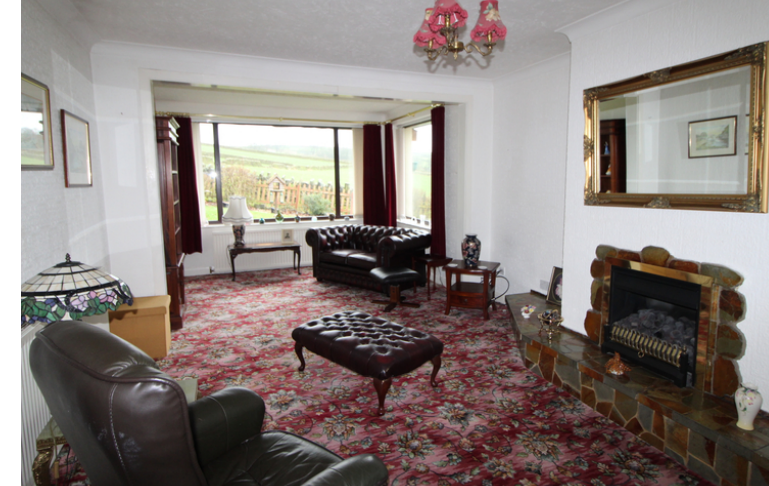
Hillside View, Laycock Lane, Laycock, Keighley, West Yorkshire, BD22 0PN