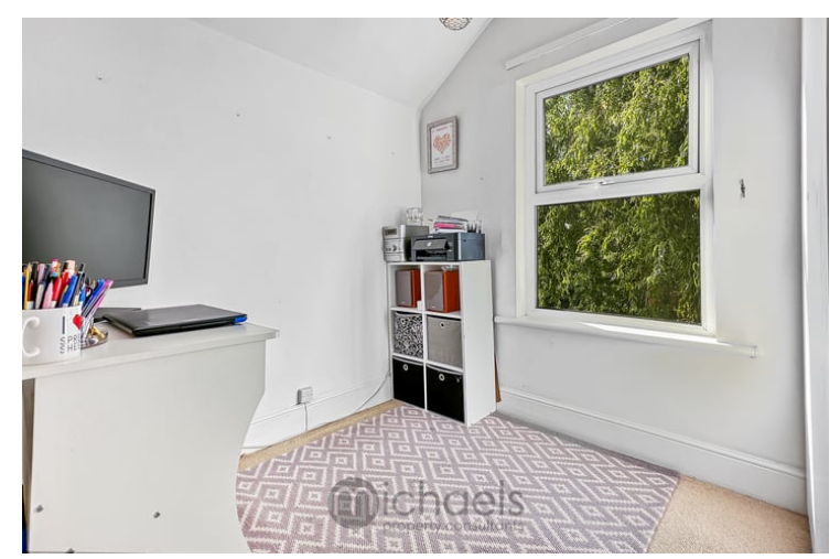
8'1" \times 6'10" (2.46m x 2.08m) Window to rear aspect, radiator, benefit of fitted wardrobes