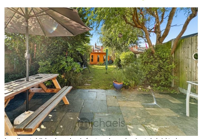
A well-established garden is featured, predominately laid to lawn and features an array of mature hedges, shrubs and trees throughout. Landscaped with a generous patio area, it provides the ideal place for outdoor dining and peaceful reflection. A garden storage unit is available for convenience, whilst there is the added benefit of a garden room to the rear - complete with full power and could be utilised as a home gym, office or children's play area. Complete with off road parking on a shingle driveway to the front of the property.