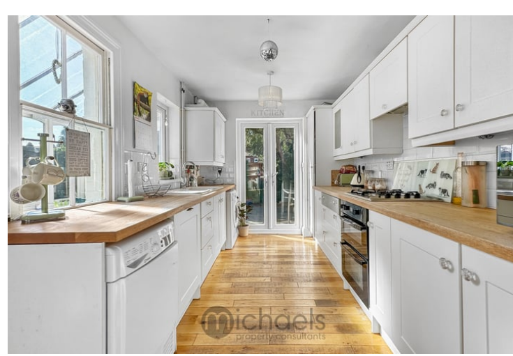
15' 5" x 8' 1" (4.70m x 2.46m) A fitted kitchen comprising of; a range of fitted base and eye level units with wood worksurfaces over, inset sink, drainer and taps over, integrated; oven/grill, inset hob with extractor fan over, dishwasher, space for; washing machine, tumble/dryer & fridge/freezer, tiled splashback, radiator, wall mounted gas boiler, windows to side aspect, patio doors to rear garden and access to conservatory