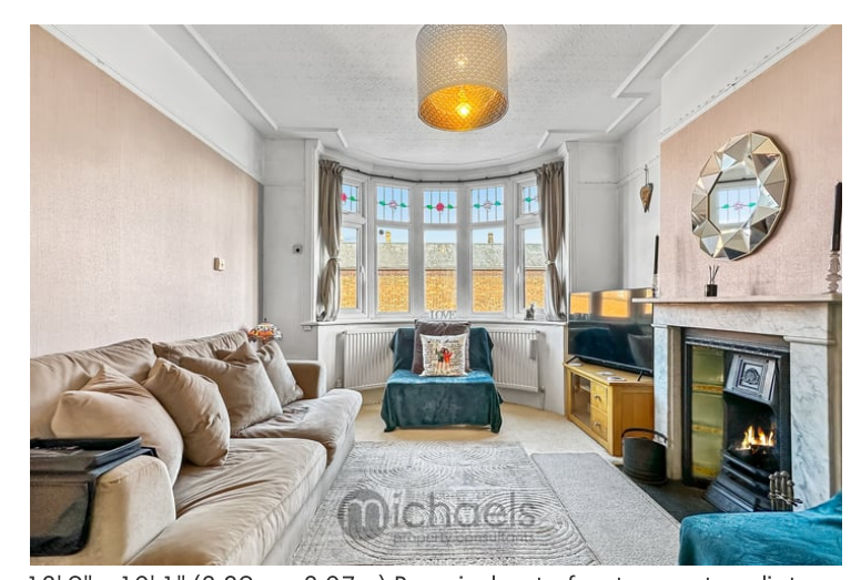
12' 9" \times 10' 1" (3.89m \times 3.07m) Bay window to front aspect, radiator, original fireplace with marble surround, communication points