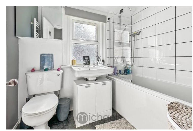
A first floor family bathroom suite comprising of; panel bath with shower over, screen and tiled wall finish, W.C, vanity wash hand basin, towel rail, window to side aspect