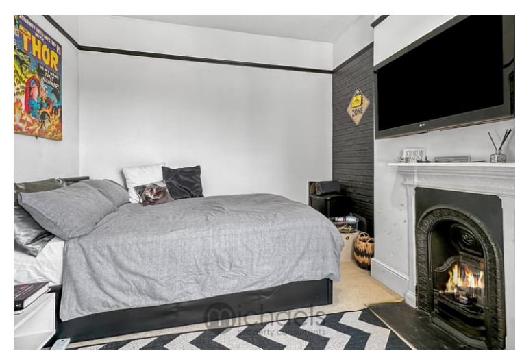
11' 1" x 9' 2" (3.38m x 2.79m) Window to rear aspect, radiator, cast iron feature fireplace