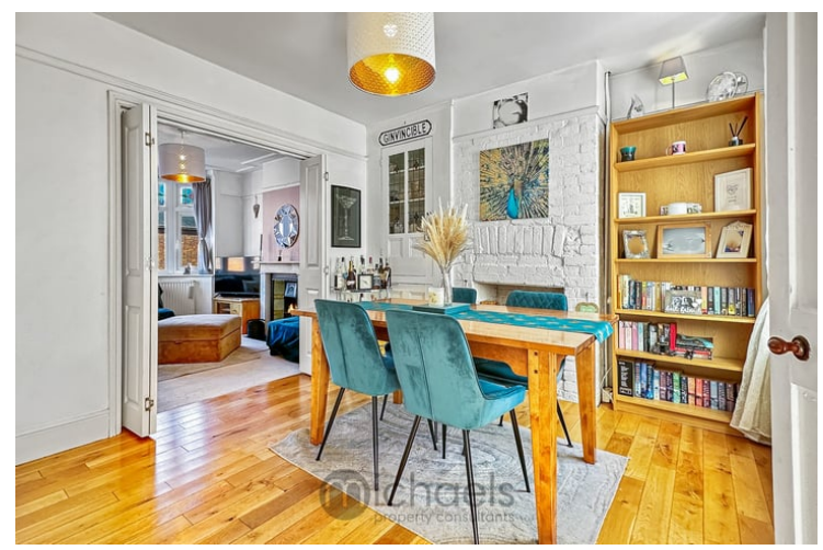
13' 11" x 11' 3" (4.24m x 3.43m) Window to rear aspect, radiator, oak flooring throughout, retractable doors to living room, access to: