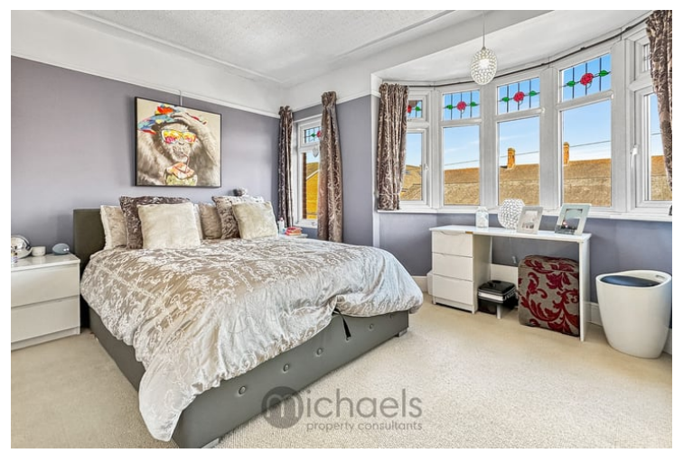
14'0" \times 13'0" (4.27m x 3.96m) Bay window to front aspect, radiator, feature fireplace, inset storage cupboard, loft access