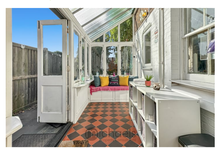
14'6" \times 5'7" (4.42m x 1.70m) Windows to all aspect, patio doors to side aspect, tiled flooring