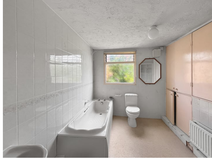
Obscure window to rear, radiator, part tiled walls, low level WC, wash hand basin, low level WC, shower encloser.