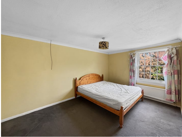
15' 3" x 10' 3" (4.65m x 3.12m) Double glazed window to front, radiator.