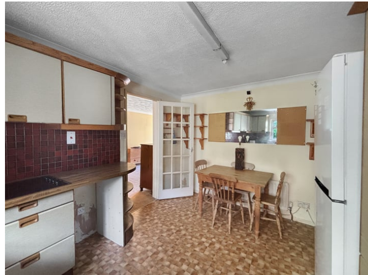
13' 5" x 10' 6" (4.09m x 3.20m) Window to front, range of wall and base units, laminate worktops, radiator, tiled splash back, induction hob, oven, space for fridge/freezer, washing machine, stainless steel sink.