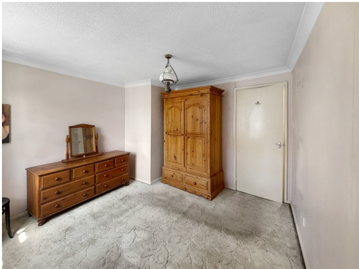
11' 6" x 10' 2" (3.51m x 3.10m) Double glazed window to rear, radiator.