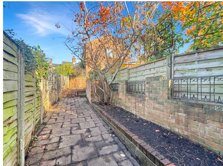
Enclosed by fencing and brick wall, garden shed.