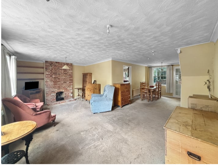
20' 1" x 11' 4" (6.12m x 3.45m) Front door, window to front, fireplace, open plan living.