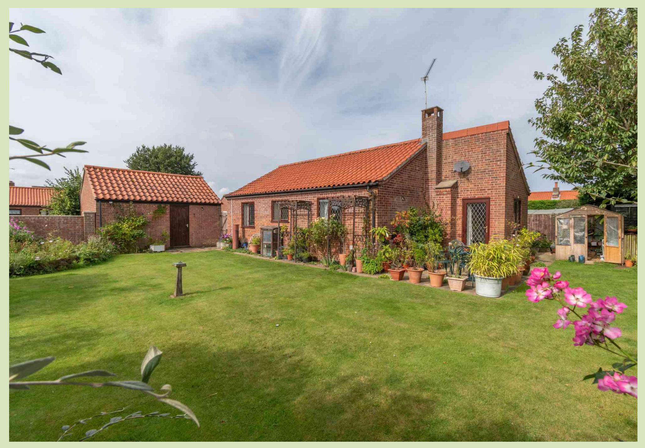
37 Walcups Lane, Great Massingham Guide Price £265,000