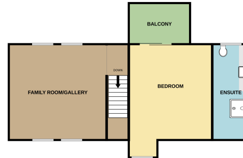
4 THE COACH HOUSE, DUNKINTY, ELGIN, IV30 8RF

Whilst every attempt has been made to ensure the accuracy of the floorplan contained here, measurements of doors, windows, rooms and any other items are approximate and no responsibility is taken for any error, omission or mis-statement. This plan is for illustrative purposes only and should be used as such by any prospective purchaser. The services, systems and appliances shown have not been tested and no guarantee as to their operability or efficiency can be given. Made with Mapbox 12/2021