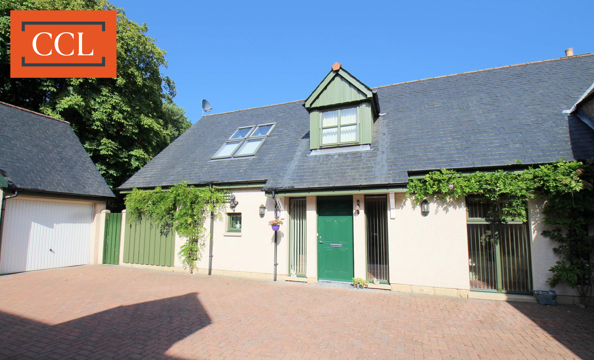
4 The Coach House | Dunkinty | Elgin | Moray | IV30 8RF