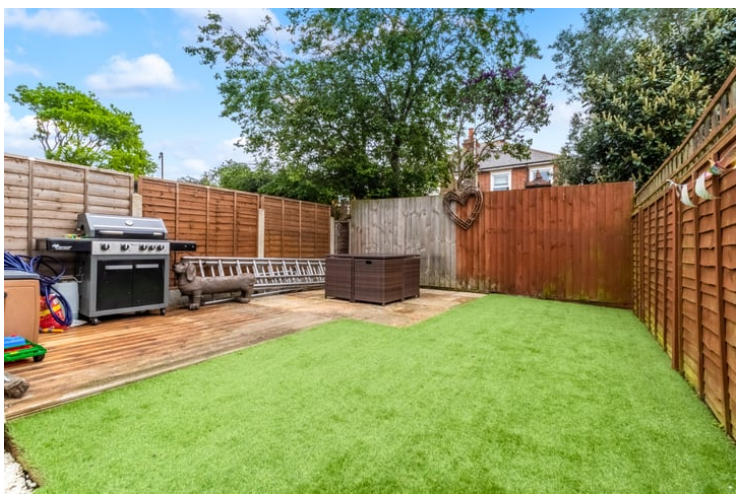
Enclosed private rear garden with two patios, decking area and the remainder laid to artificial grass, enclosed by privacy fencing, side access leading to the front aspect of the property.