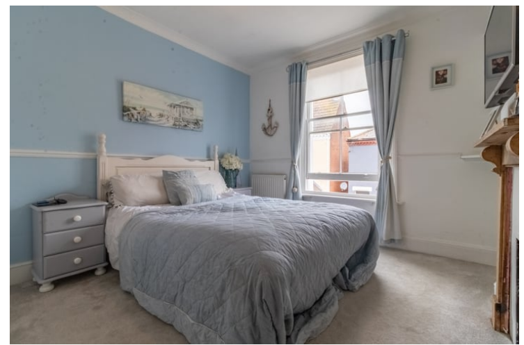
11' 11" x 10' 04" (3.63m x 3.15m) Sash window to front, radiator, space for double bed and furniture, wood mantle, radiator, fitted wardrobes.