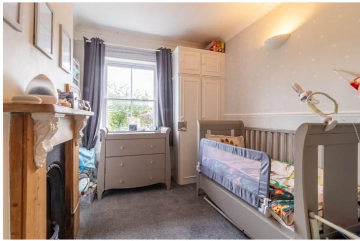
10' 06" x 8' 3" (3.20m x 2.51m) radiator, window to rear, space for bedroom furniture.