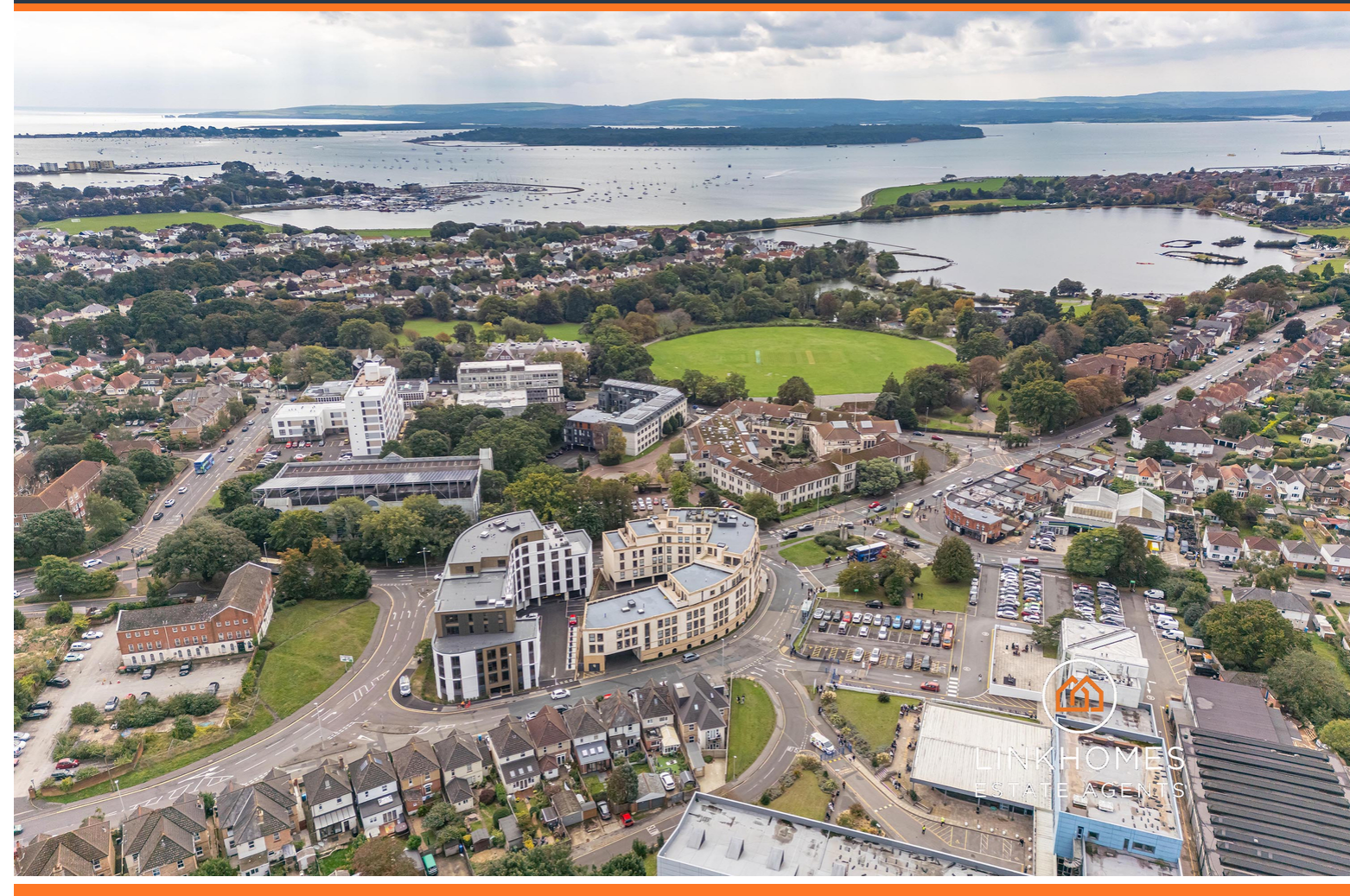
Flat 68, The Cosmopolitan, 1-3 Commercial Road, Poole, Dorset, BH14 0FD Guide Price £300,000

Link Homes 67 Richmond Road Lower Parkstone BH14 0BU sales@linkhomes.co.uk www.linkhomes.co.uk 01202 612626