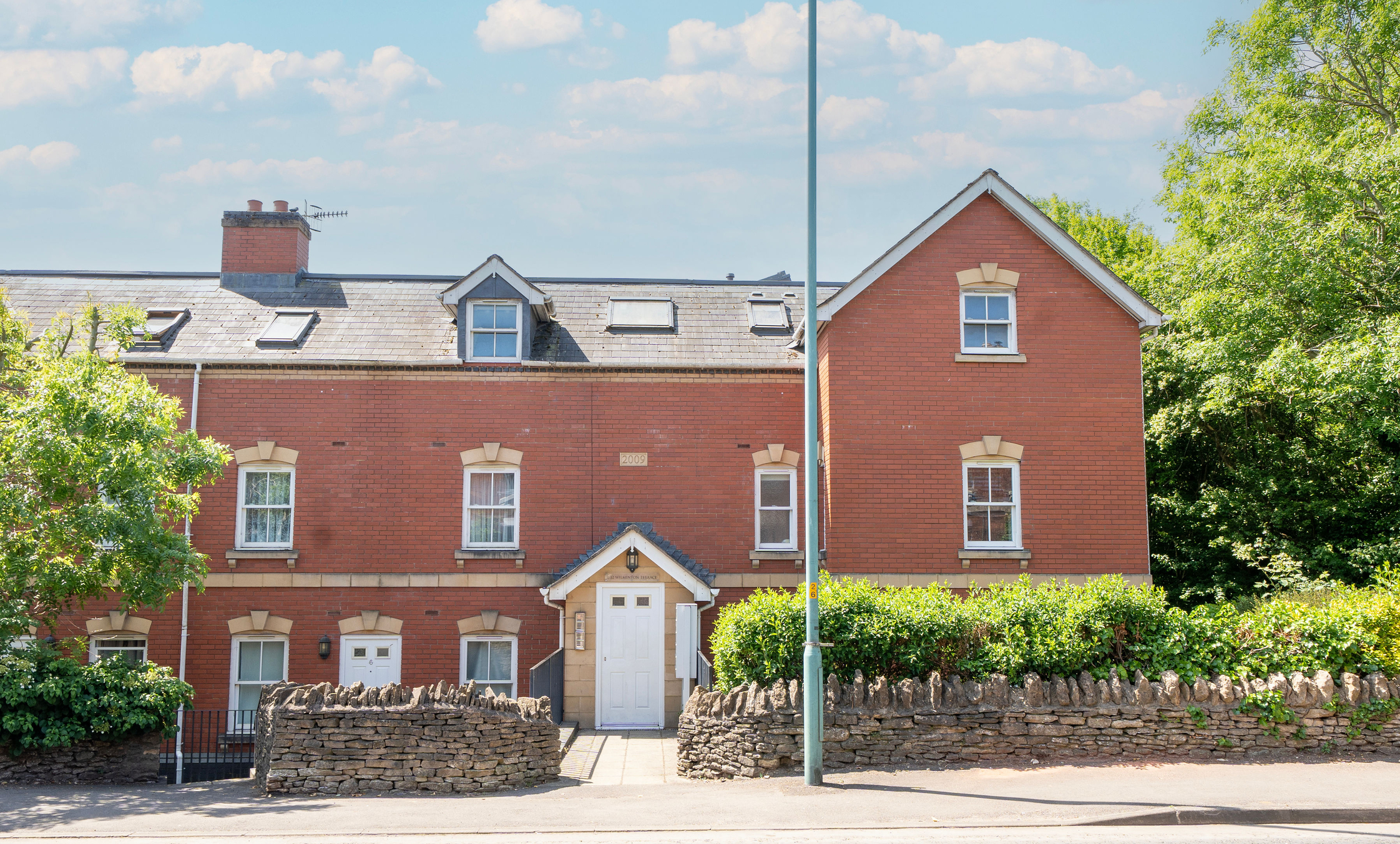
Flat 10 Wilmlinton Terrace, London Road, Stroud, Gloucestershire, GL5 2BZ £174,950