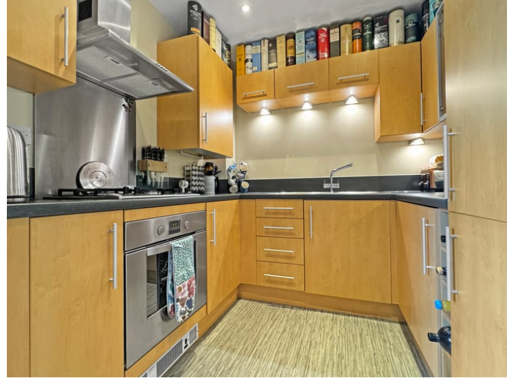
7' 8" x 7' 2" (2.34m x 2.18m)