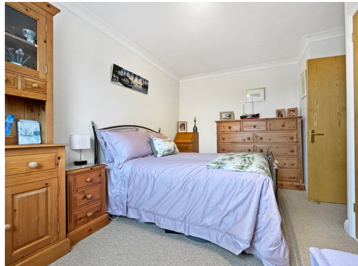
13' 8" x 10' 9" (4.17m x 3.28m)