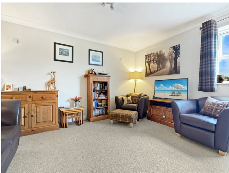
14' 0" x 13' 6" (4.27m x 4.11m)